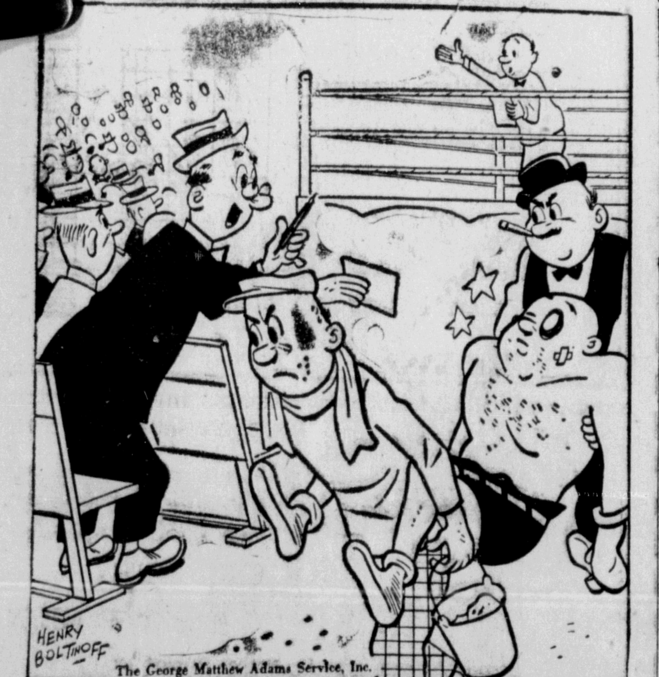
"You were magnificent! Can I have your autograph?"