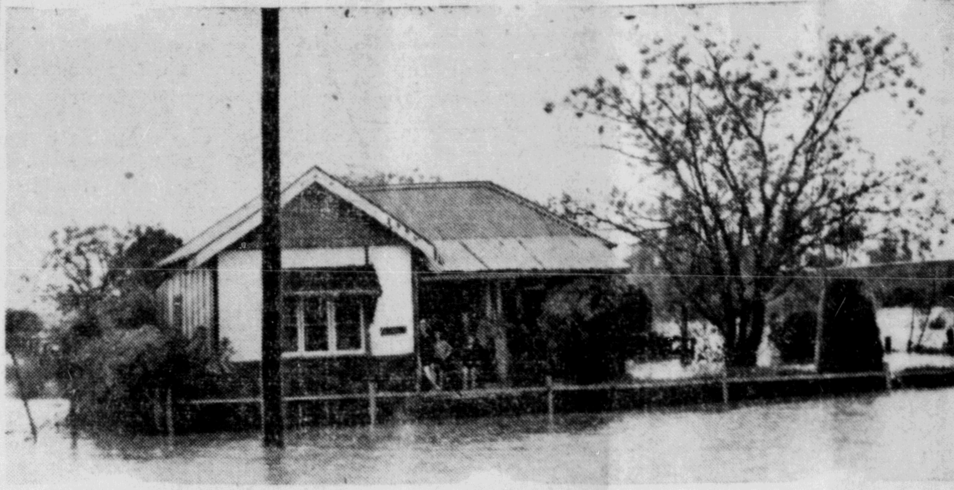
DROUGHT IN CANADA, FLOODS IN AUSTRALIA —While many parts of Canada have had the hottest, driest June on record, Australia has seen record rain and floods. Here is a home near Sydney where flood waters marooned hundreds of homes, caused six deaths, ruined thousands of acres of farm land.