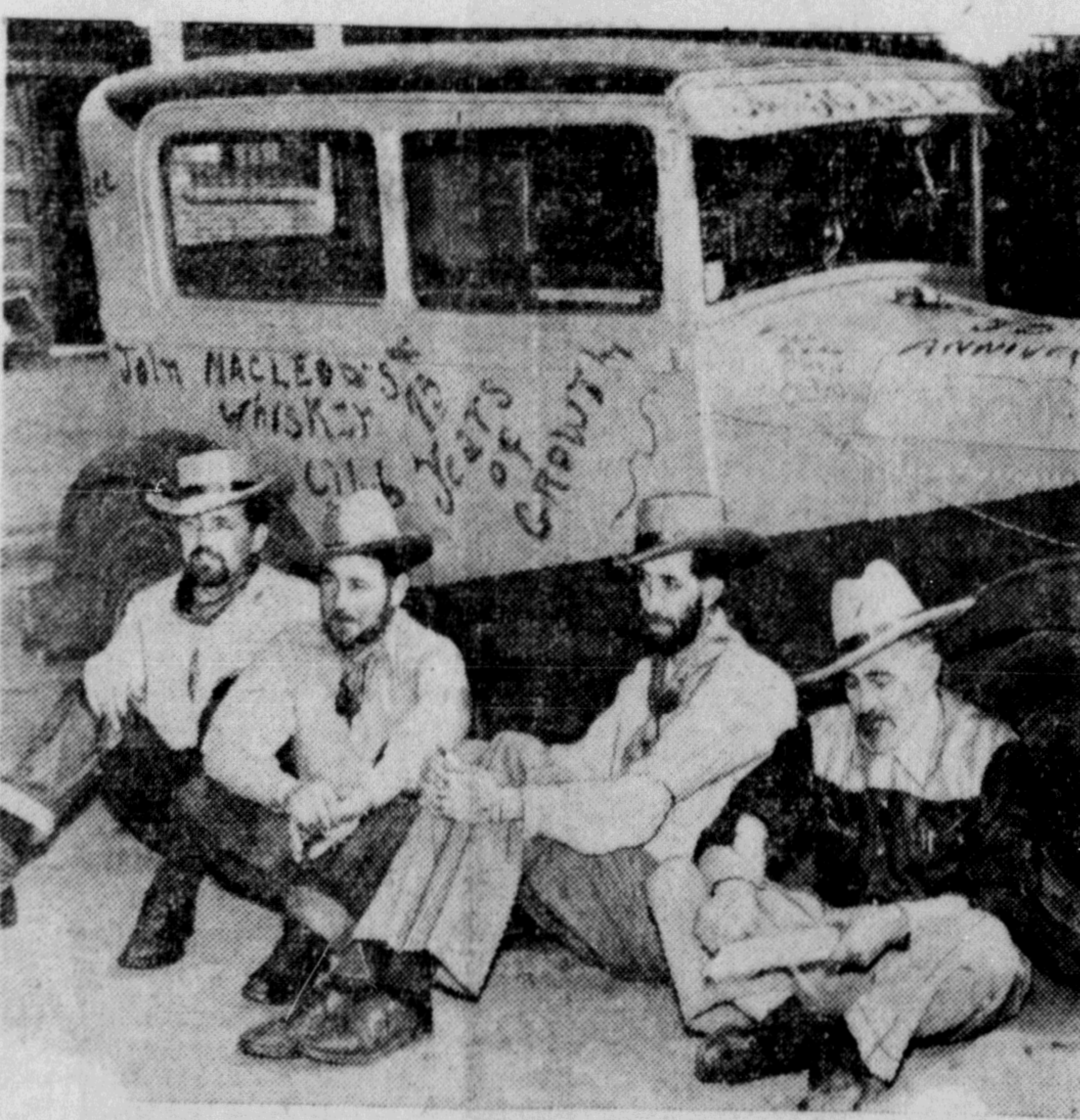
MACLEOD REVIVES COLORFUL PAST —These gentlemen with the mattress-faces are citizens of Macleod, Alta., members of the MacLeod Anniversary Whiskers' club who won't touch a razor until the town's anniversary celebrations are over this month. The colorful history of MacLeod will be the basis for a pageant complete with Blackfeet Indians in war paint, scarlet-coated R.C.M.P. and rum-runners. The town's history began in 1874 when a log fort was built on an island in the Oldman river to suppress invading whiskey peddlers from Fort Benton, Montana, who had built a fort themselves on Alberta soil. They called it Fort Whoop-up and it deserved its name.