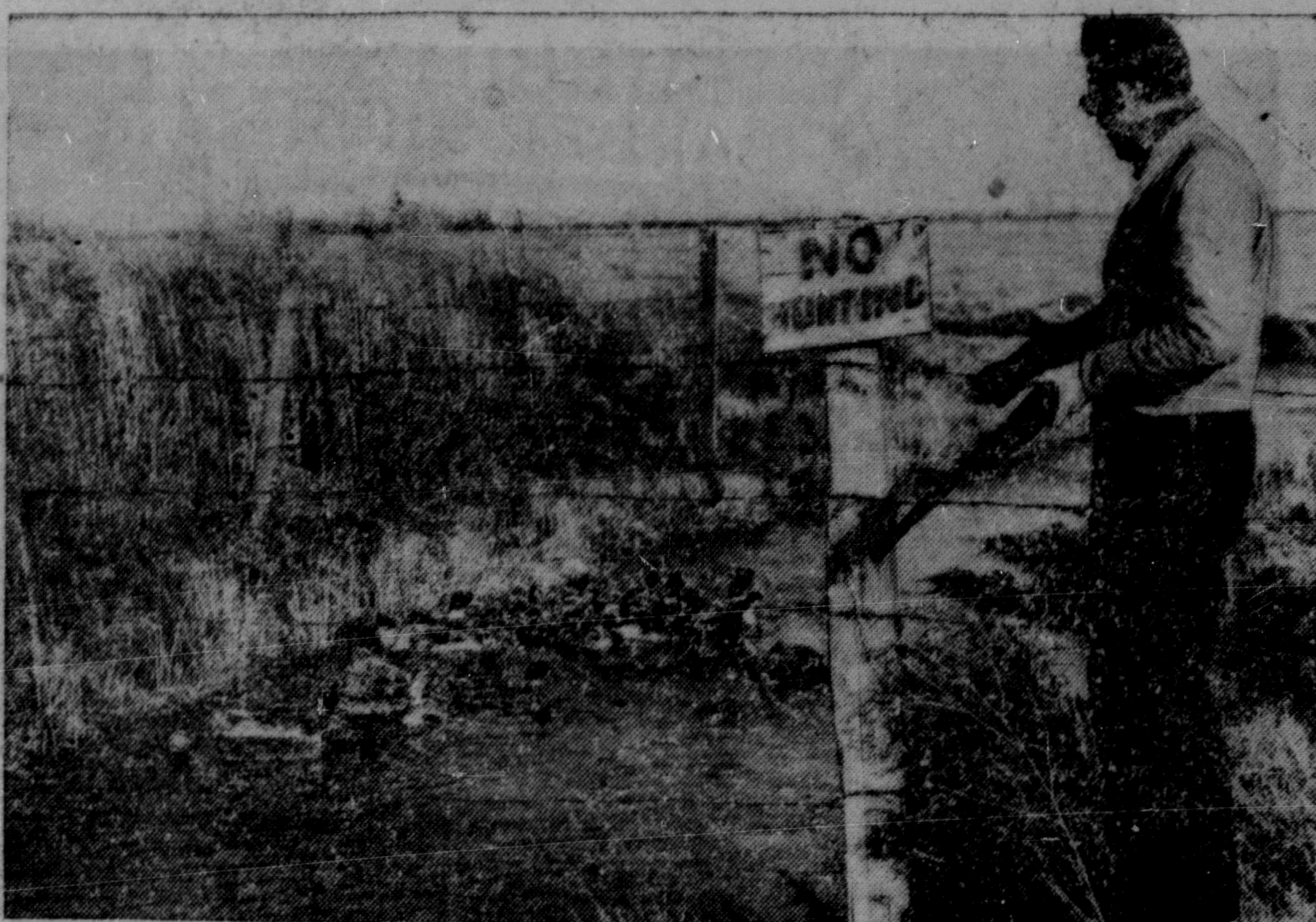
THEY KNOW THEIR RIGHTS—Just about the only ducks encountered by two hunters north of Rosemary, Alta., were these smart birds, taking unfair advantage of the protection of a dilapidated warning sign. Only one part of one pond, miles from anywhere, was protected, but that's where the ducks were congregated, giving duck-laugh to the frustrated nimrods.

SASKATOON (CP)—The Social Credit League Saturday drafted the first Social Credit manifesto for province of Saskatchewan. The manifesto represents the program on which the League will seek to organize support in the province.