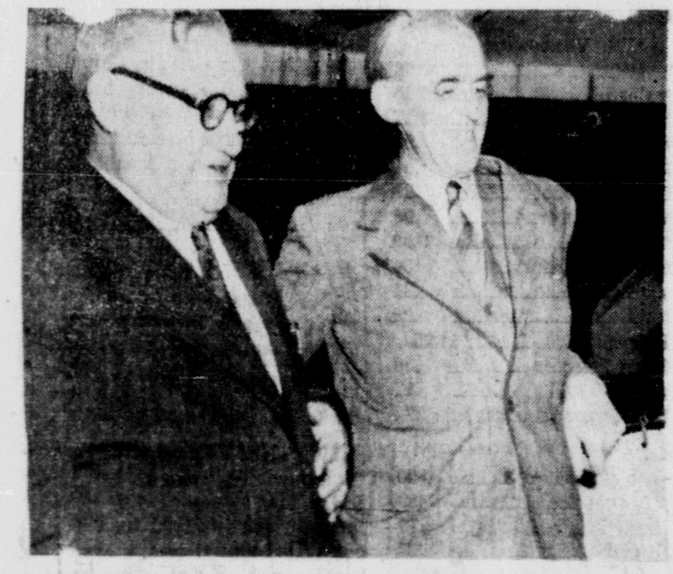
"NO FURTHER LOAN"—CRIPPS—British Foreign Secretary Ernest Bevin, left, and Sir Stafford Cripps, chancellor of the exchequer, now in Washington, for the Anglo-American-Canadian dollar-crisis conference, told newsmen that Britain will ask no additional grants from the U. S. Cripps emphasized his position to devaluation of the British pound as a possible solution of his country's dollar shortage.

CLASSIFIED ADVERTISING IN THE DAILY NEWS PAYS!