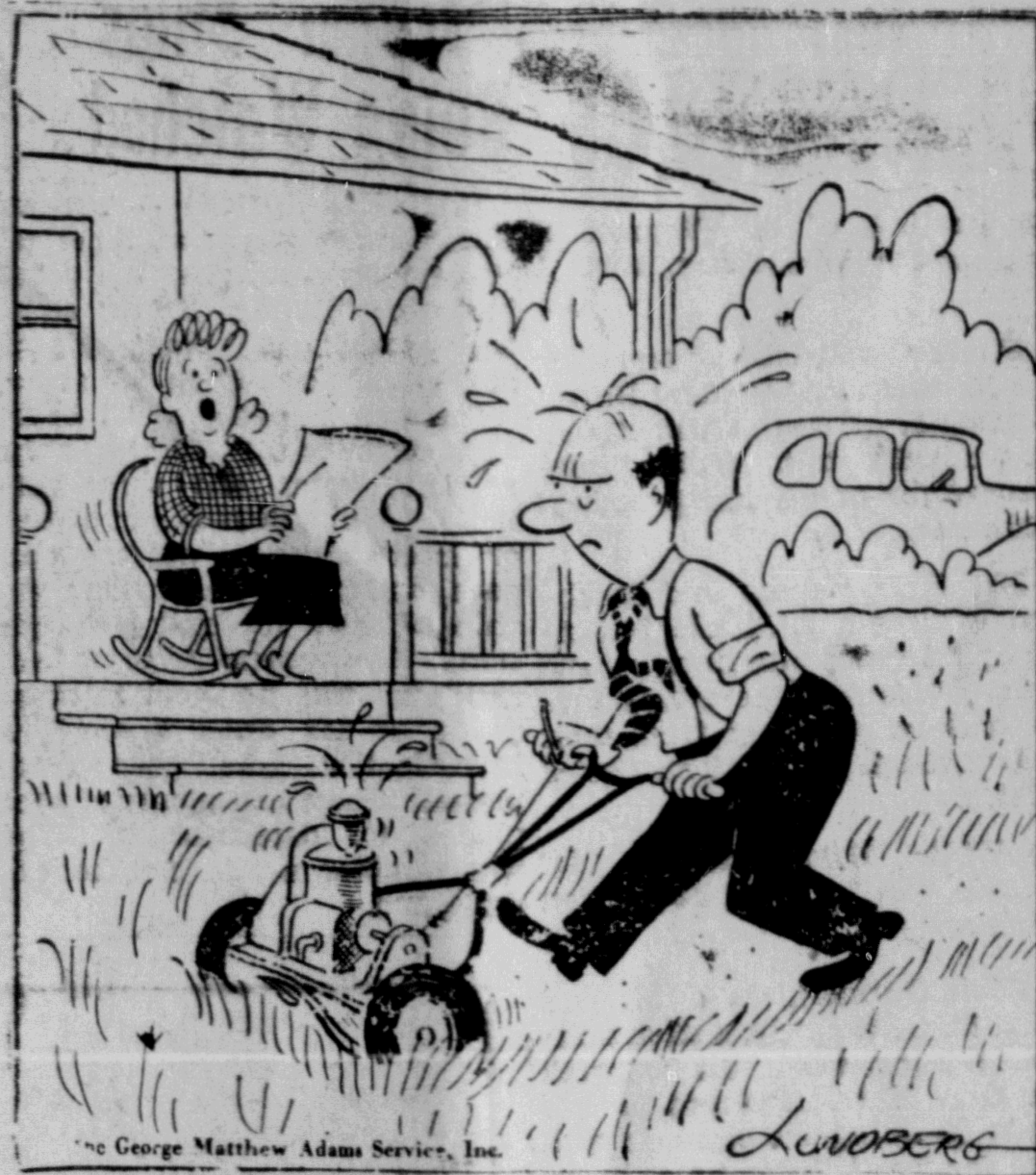
"Not too fast now—a little more to the right— Back up a bit—giv'r some more gas..."