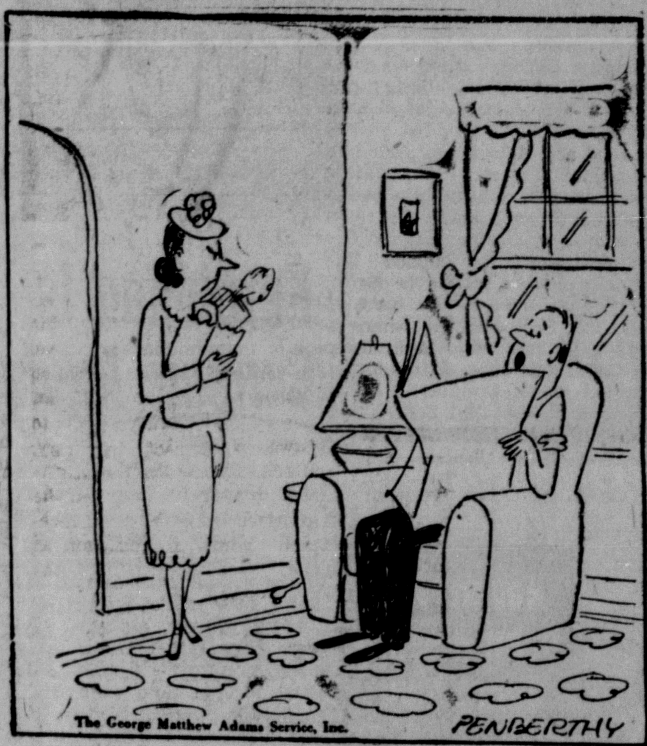
"Oh, nothing of importance. A couple of salesmen came, I paid the paper boy, and your mother called."

SAN FRANCISCO — Precautions to help guard all American Pacific ports against the possibility of "Trojan Horse" ships, endeavoring to plant atomic bombs are already in full effect. Customs inspectors will board and examine all foreign ships as they enter the three mile limit. Any indications of atomic or bacteriological warfare cargoes will result in holding the ship offshore for full investigation. Any vessels arousing any suspicion will be held in some strait or bay until a complete investigation has been completed. There are plenty of such places for detention of ships where cities would not be endangered.