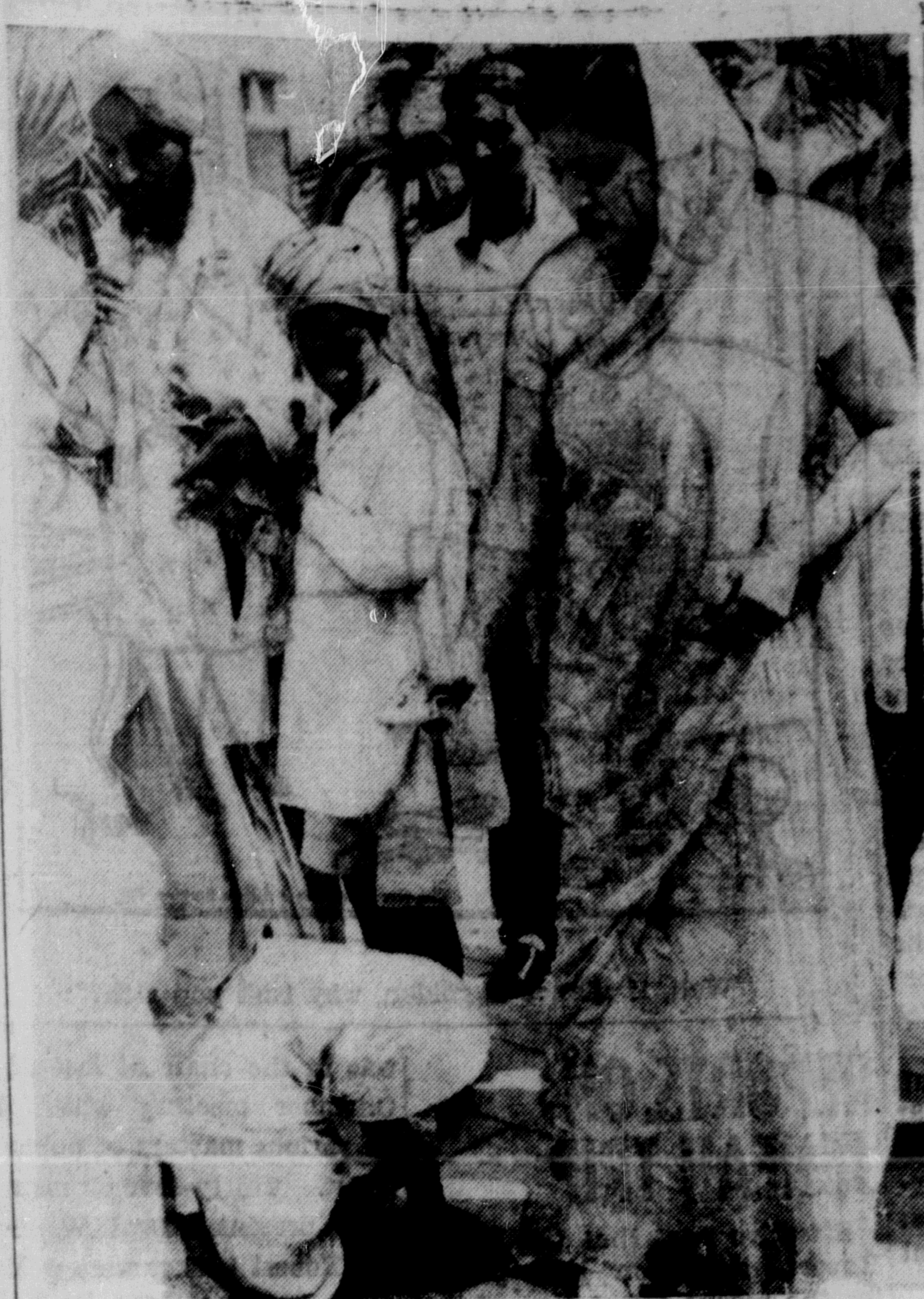
"I KISS YOUR FEET, MADAM"—During their stay in Delhi, the Maharajah and Maharani of Kashmir visited Kashmiri victims of raids and atrocities at their camps. They distributed money, food and clothing. This poignant scene took place after the Maharani had listened to the pathetic story of an old woman who had lost everything. The old woman was given a gift of money and is here shown kissing the feet of the donor.

PRINCE RUPERT FISHERIES INDUSTRY Wells (P.R.) Ltd. Labeling, Weighing TE 788 BLUE 980