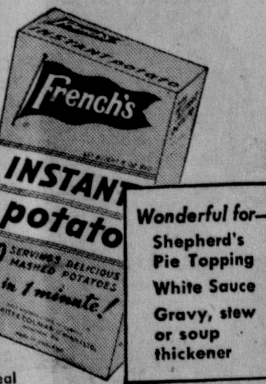
Wonderful for—Shepherd's Pie Topping, White Sauce, Gravy, stew or soup thickener

Sole distributors in Canada: Reckitt & Colman (Canada) Ltd., Montreal