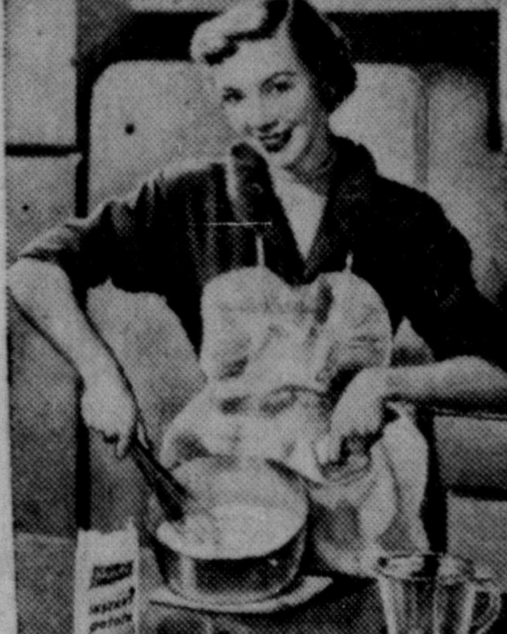
Mashed Potato in just 1 minute! Boil water, add milk and French's Instant Potato according to directions on package. Stir briskly for a few seconds until thickened, add butter and whip until fluffy.

No washing! No peeling! No cooking! No mashing!