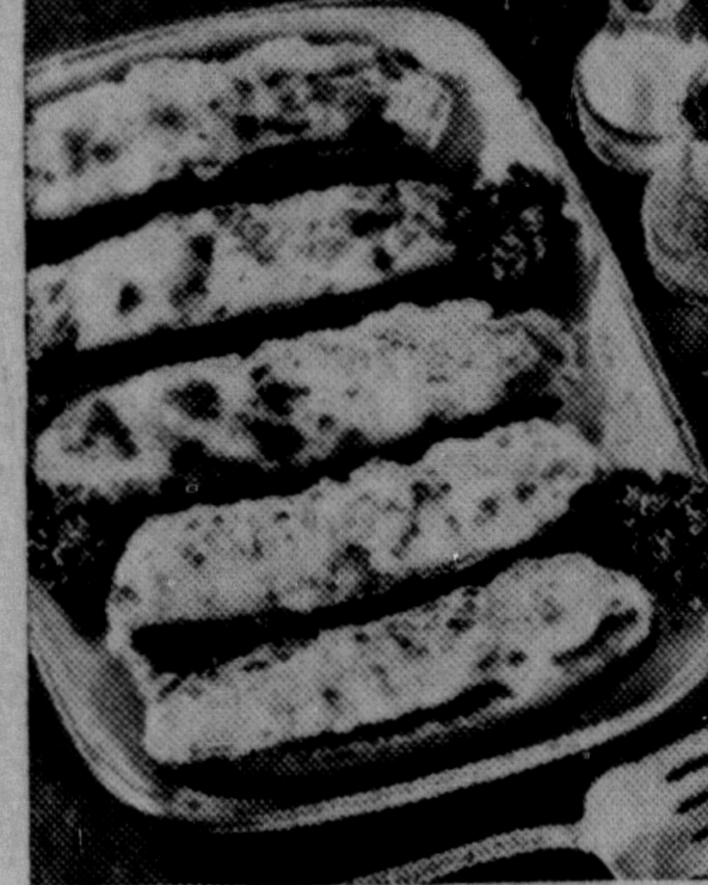
Stuffed Frankfurters—Season two cups mashed potato with parsley, onion. Split 8 cooked frankfurters, spread with French's Mustard. Stuff with potato. Brush with butter and broil 10 minutes.

Like magic! French's Instant Potato gives you top-quality potato pre-cooked by a special process that preserves nutritional values and flavor. Use it to make delicious mashed potato in just one minute, to prepare potato quickly in other exciting ways. Look for it in the canned vegetable or baby foods, section at your grocer's.