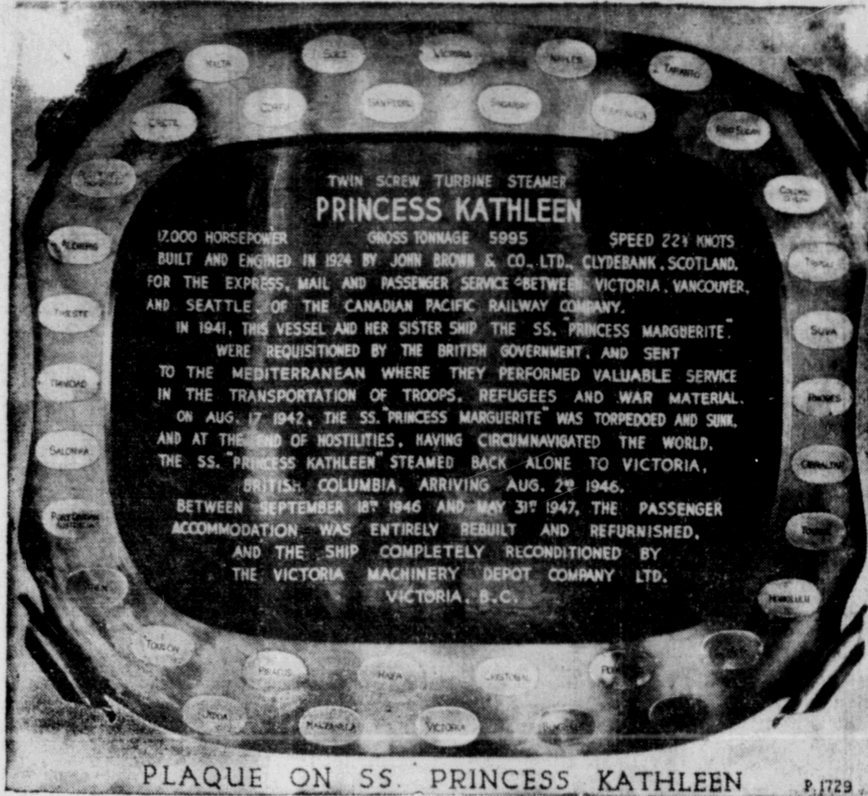
PLAQUE ON SS. PRINCESS KATHLEEN

PROUD RECORD OF A LADY—This plaque, situated in the forward saloon of the Canadian Pacific B. C. Coast Steamship luxury cruise ship Princess Kathleen tells the story of her 25-year record in peace and war. The 5,995-ton vessel, which went into the Vancouver-Alaska cruise service in June after reconditioning from wartime service is probably one of the most widely travelled coastal ships afloat. Her specifications and history are briefly recorded on the plaque. The rosettes surrounding the legend names the places she visited during wartime service.