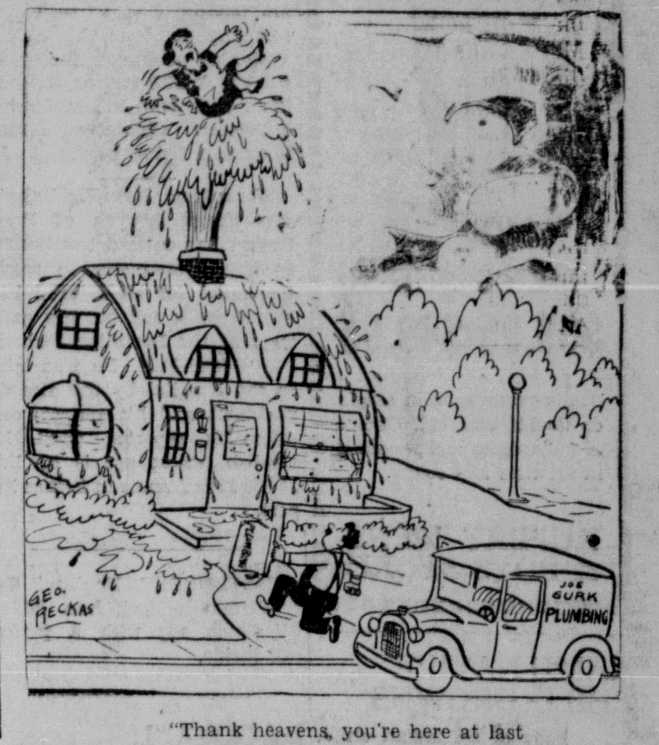
"Thank heavens, you're here at last"