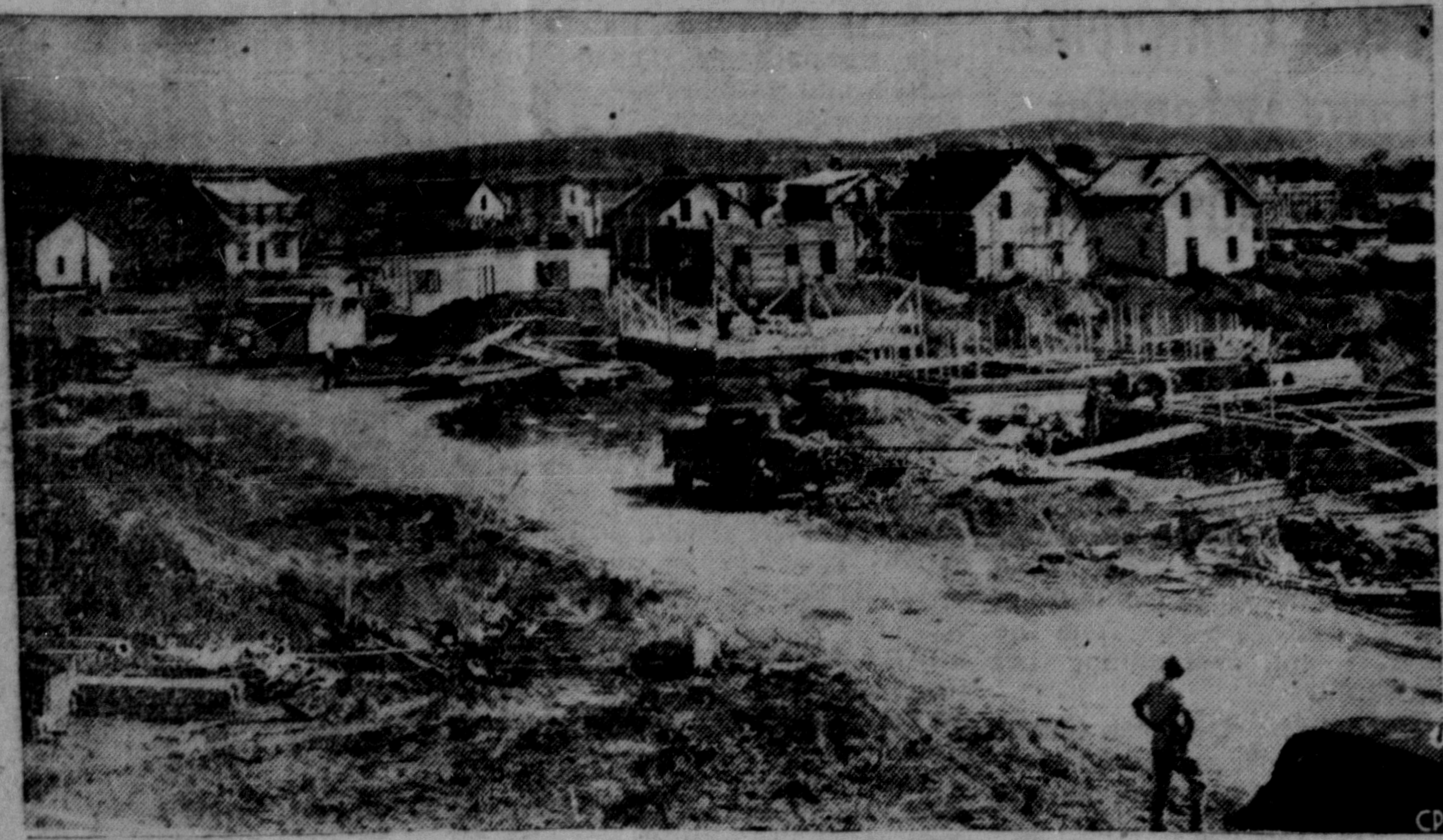
TOWN REBUILDS — The little lumber town of Cabano, Que., slowly rises from ashes. The community was two-thirds destroyed last spring in one of two disastrous fires that swept two Quebec centres. The other ravaged city was Rimouski which is also undergoing a rebuilding project. This photo shows some of the 95 new homes being erected at Cabano.