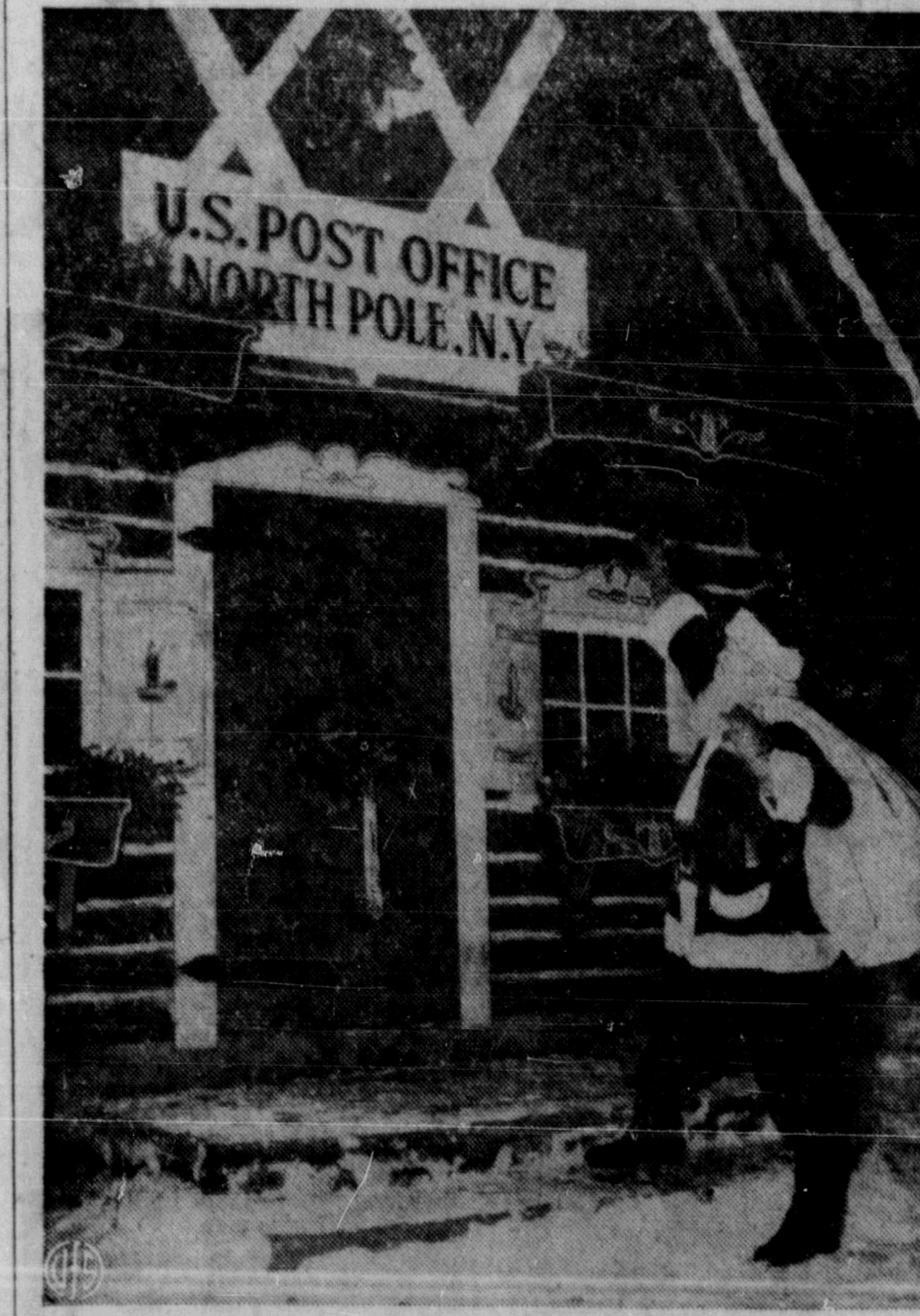
SANTA CLAUS takes one of the first shipments of Christmas presents into his new post office, high on the slopes of Whiteface Mountain in the Adirondacks in New York State. Yep! The U.S. Government finally authorized a fourth-class post office at North Pole, N.Y., and Santa's mighty proud of it.

Forecast North coast region: Cloudy and mild. Nearly continuous rain along the mainland today with showers elsewhere.