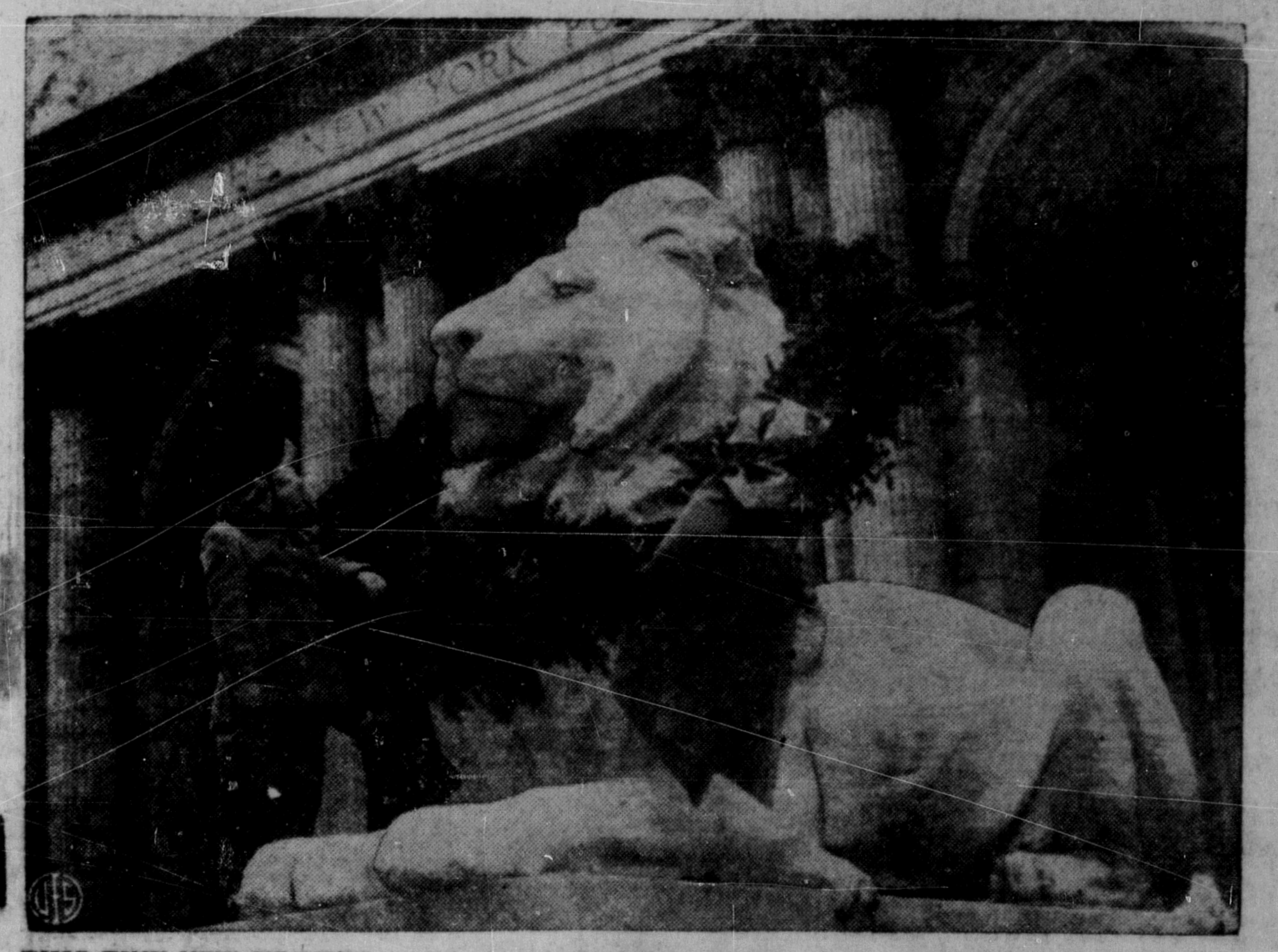
THIS TINY NEW YORKER gets a close look at one of the granite lions in front of the New York Public Library, after the annual Christmas wreaths were placed on the majestic statues.

HANOI, Indo-China.—Vietminh rebels tightened their pressure today on Dien Bien Phu, the last French fortress in northwest Indo-China.