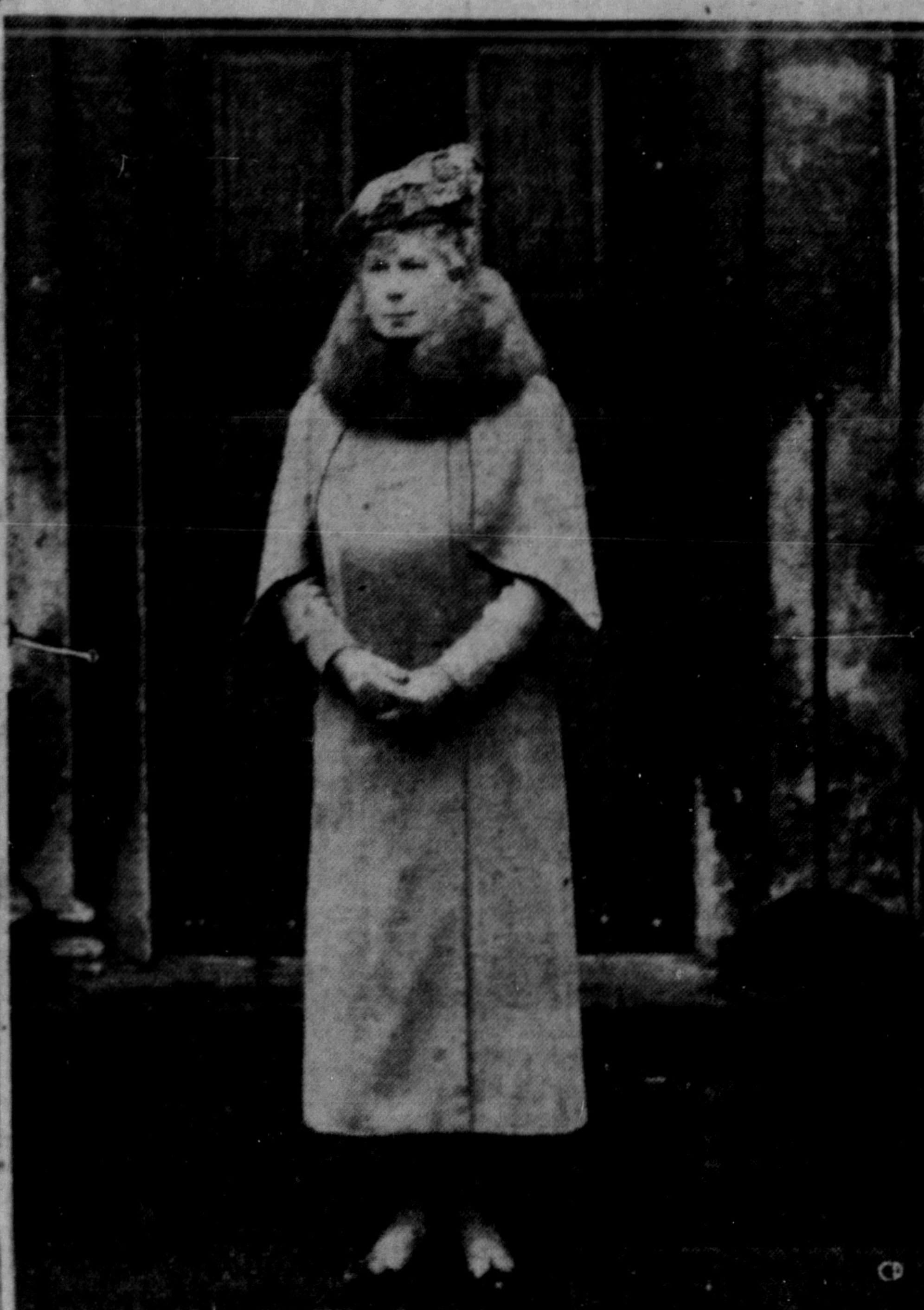
QUEEN MARY, 86 IN MAY, has been ill for the last three weeks, confined to bed at her Marlborough House residence by a gastric ailment. Because of her age she does not plan to attend the Coronation ceremony at Westminster Abbey in June.

The ship's company consists of one officer and 20 ratings. The cutter will remain here three days.