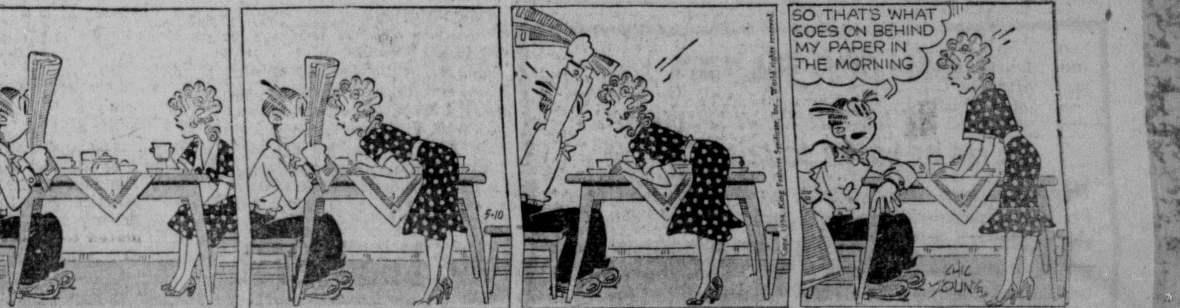
By CHICK YOUNG