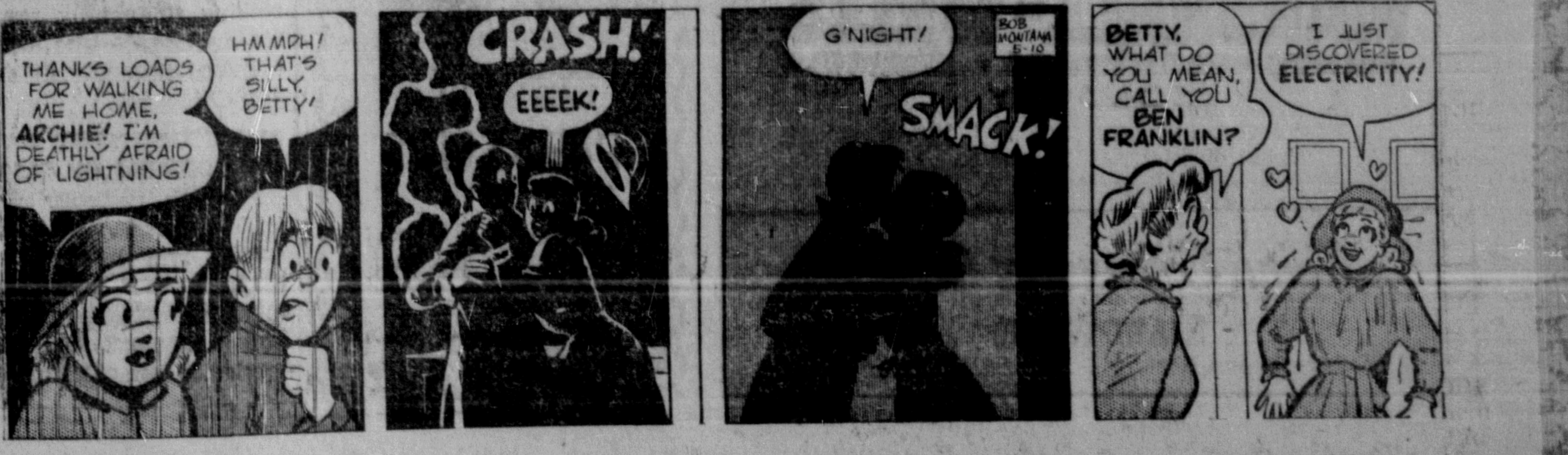
By BOB MONTANA