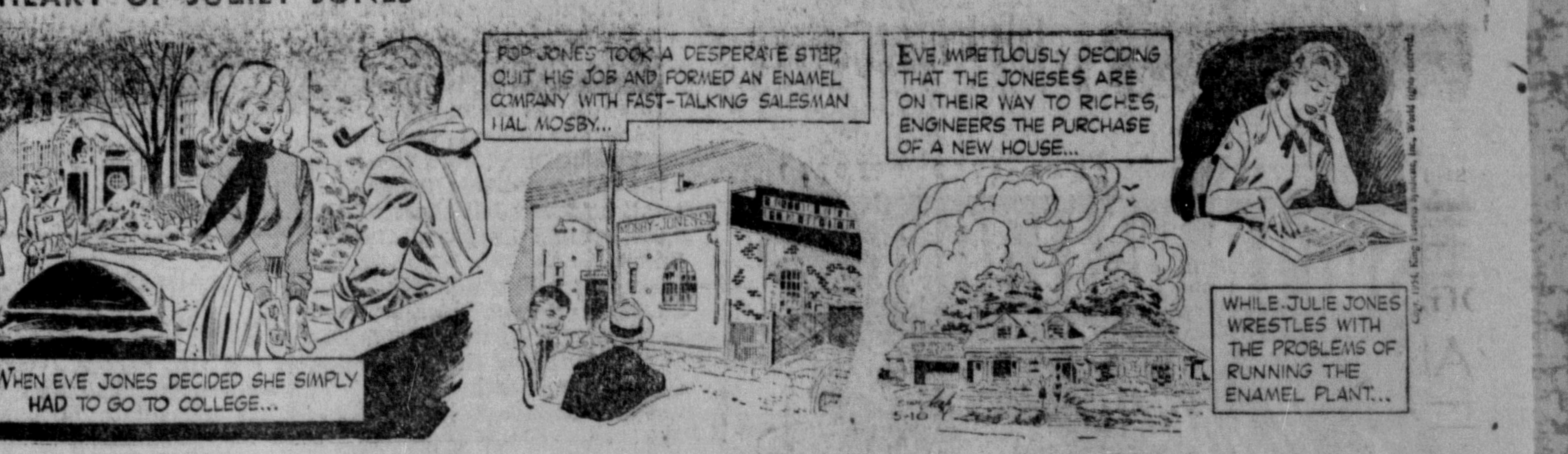
By STAN DRAKE