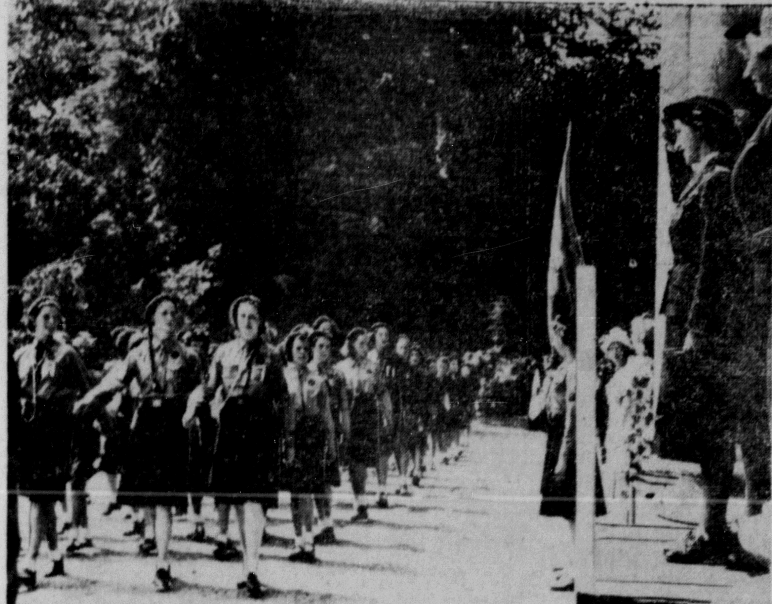
PRINCESS MARGARET has accepted the appointment as chief ranger of the British Commonwealth's Girl Guide Association. She takes the salute at a march-past. Princess Margaret succeeds Queen Elizabeth who relinquished the post on accession to the throne.