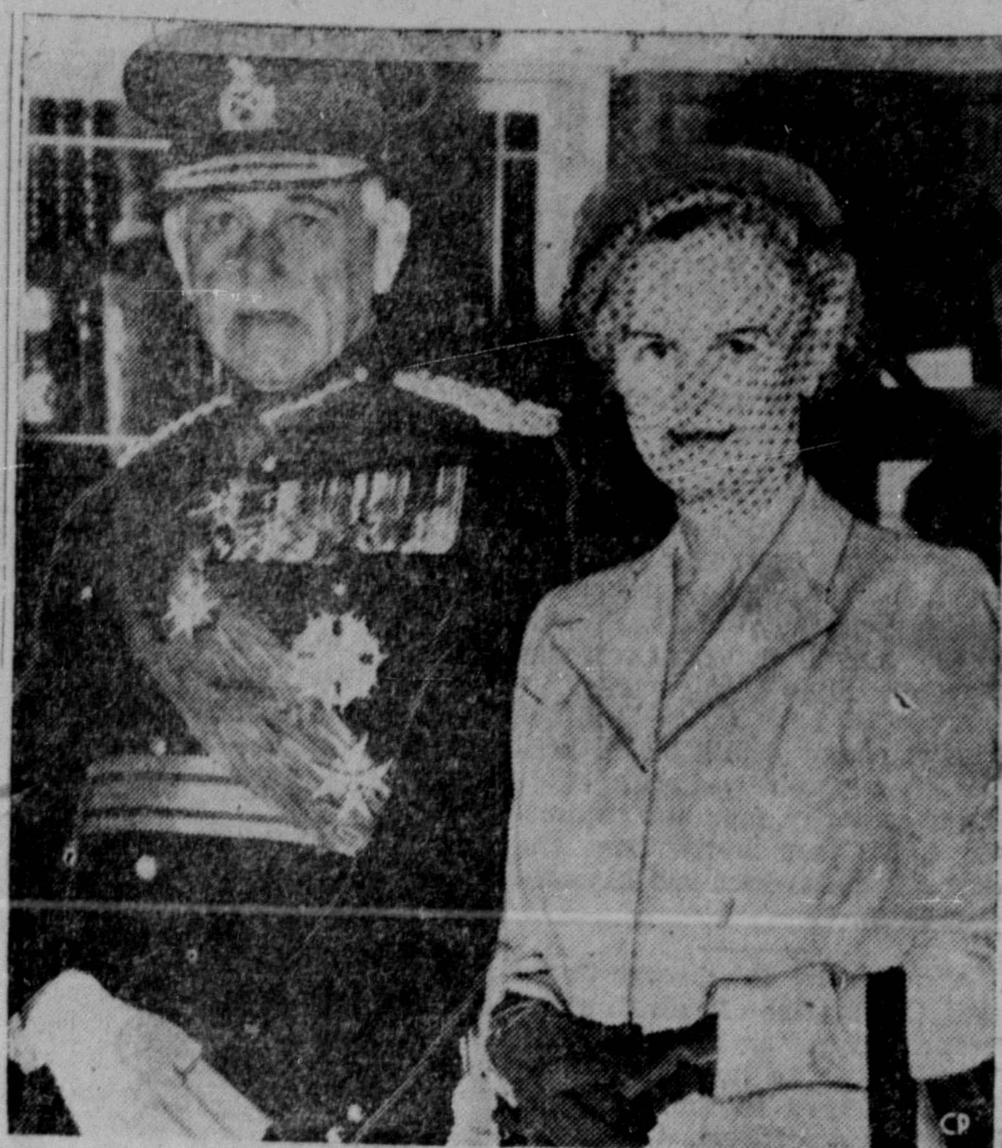
GOVERNOR-GENERAL Sir Willoughby Norrie and Lady Willoughby will be hosts to the Queen and the Duke of Edinburgh when the Royal couple visit New Zealand next January. Sir Willoughby, a commander of the 30th Corps in the Libyan desert campaign in the Second World War, was appointed governor-general of New Zealand in 1952.

Following her talk, members enjoyed a "buzz" session on children's problems with regard to Christian education.