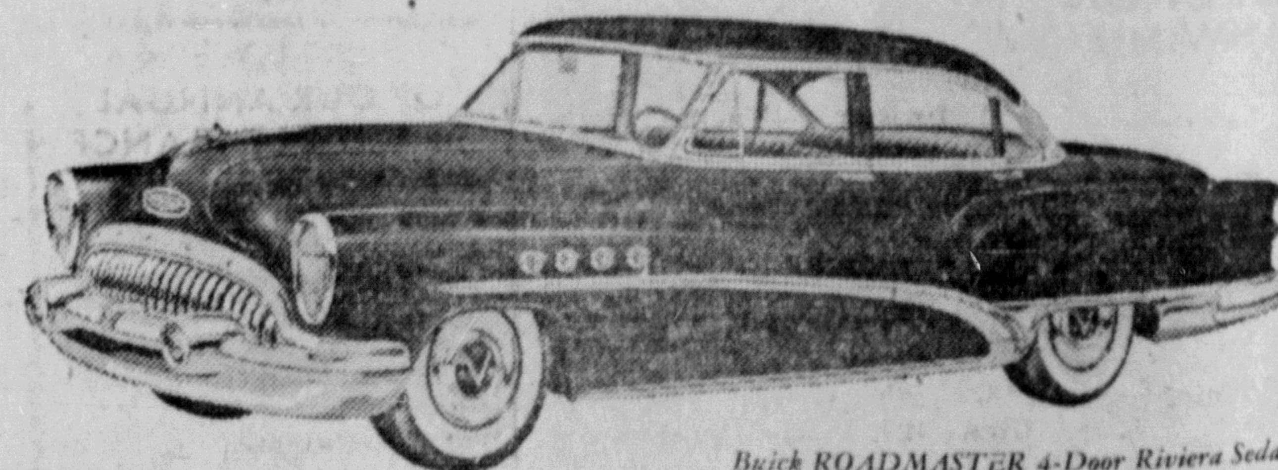
Buick ROADMASTER 4-Door Riviera Sedan

On Display CIVIC CENTRE THURSDAY 7:30 p.m.