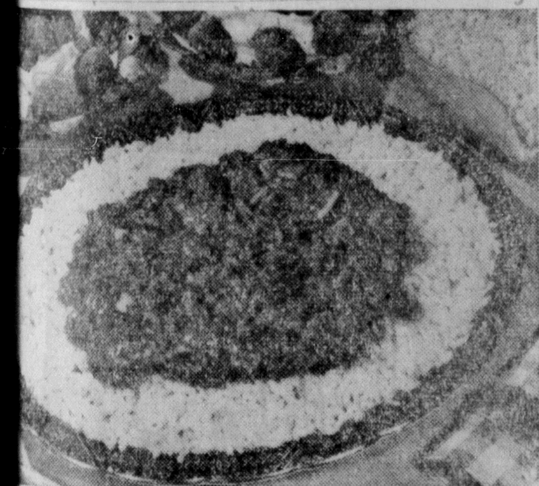
Fluffy White Rice is Topped With Super Satisfying Italian Meat Sauce