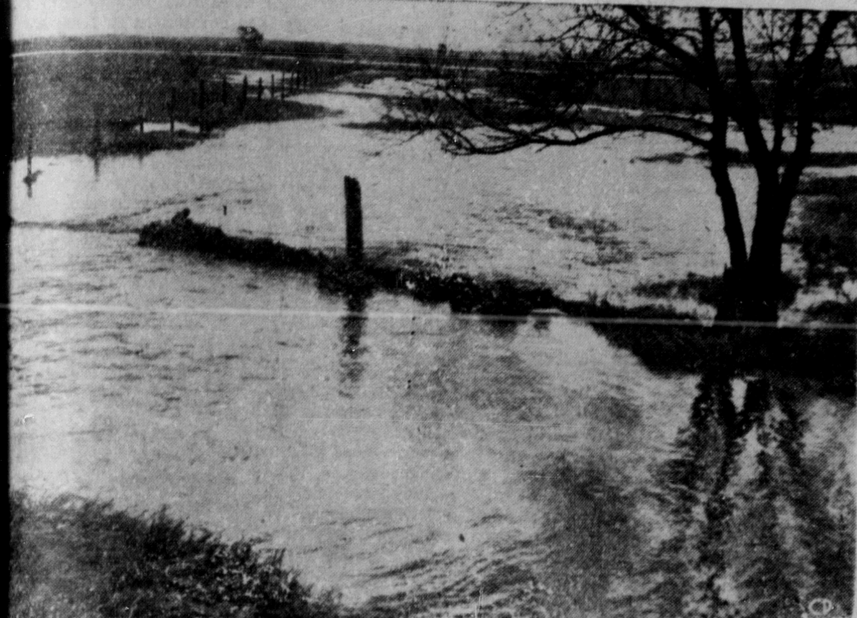
WORST FLOOD IN 30 YEARS in some sections of Manitoba washes across wheat fields, uprooted families from their homes. This field near Brandon is typical of the damage resulting from torrential rains and swollen rivers. Highway and rail communications in the Riding Mountain area were disrupted.