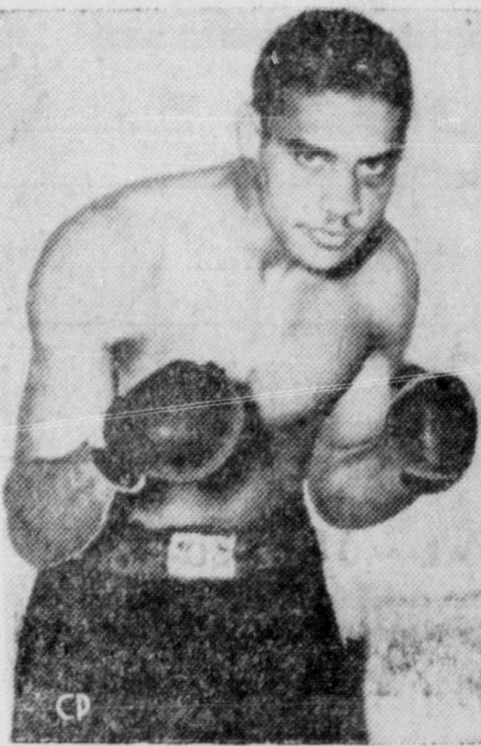
EARL WALLS OF TORONTO , heavyweight boxer, won second place among Canada's outstanding athletes in The Canadian Press annual sports poll for 1953. The Toronto heavyweight boxer hit the headlines during the year with knock-outs over contending heavy-weight title fighters.