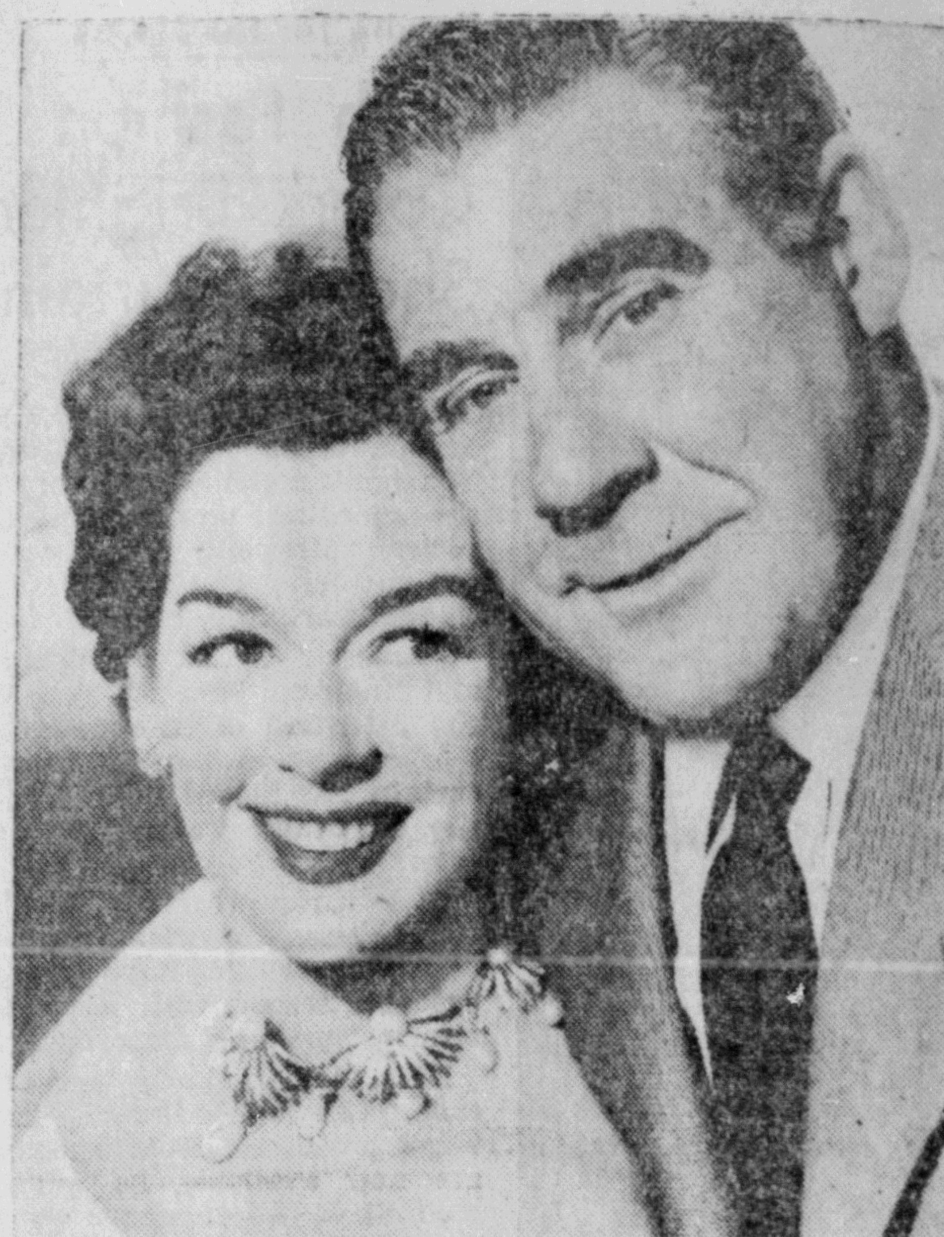
ROSALIND RUSSELL and Paul Douglas portray an estranged couple whose domestic differences are ironed out via the steam roller tactics of the armed forces. Starring with them is Marie Wilson in "Never Wave at a Wave." Frederick Brisson's hilarious comedy romance which opens tomorrow at the Capitol.

Dancing followed and guests and bowlers alike enjoyed reminiscing about the season's many ups and downs, with their good bowling, lucky breaks, and tough luck.