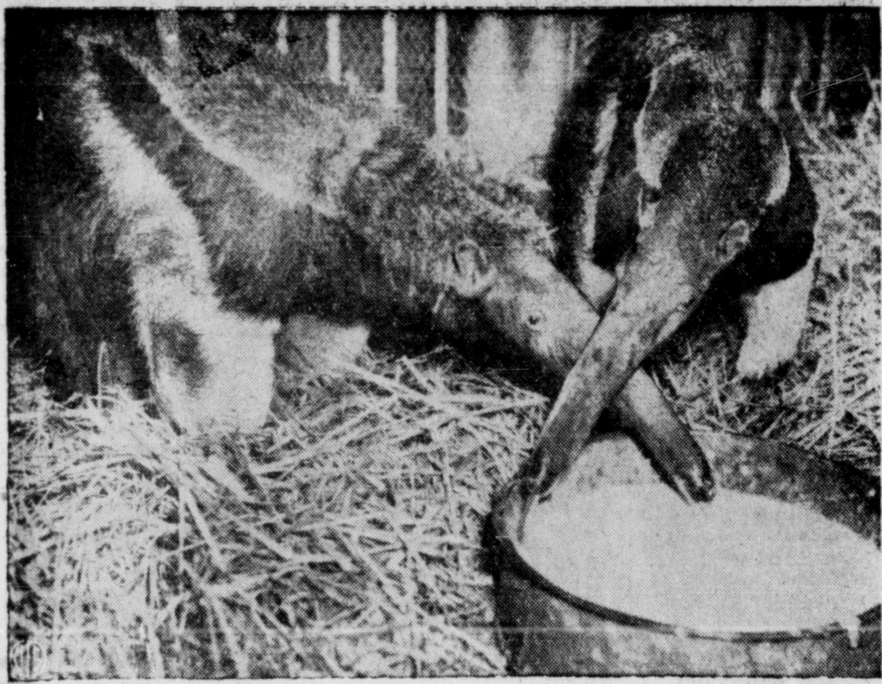
SNOUT PASSES OVER SNOUT as two newly arrived anteaters enjoy supper at the Vincennes Zoo in Paris. No ants here—just fancy soup of milk, raw eggs and meat. They were given to the Vincennes Zoo by a zoo in Antwerp, Belgium, but their original home is South America.

CHANGES JOB Composer Antonin Dvorak was destined to be a butcher, until a teacher encouraged his music studies.