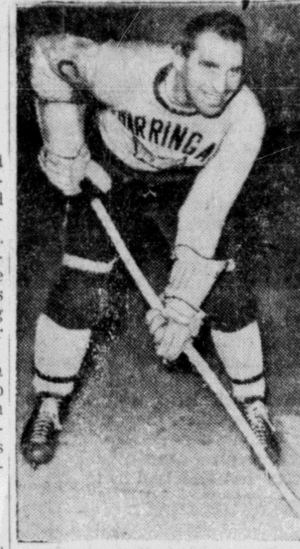
VETERAN HOCKEY PLAYER

STANDINGS Senior B League Manson's ..... 10 3 20 3 Gordon & Anderson ..... 7 6 14 3 CCC 300 Club ..... 3 11 6 2 Inter A League North Star ..... 11 2 22 3 Fraser & Payne ..... 7 5 14 4 Watts & Nickerson ..... 0 11 0 5 Inter B League Manson's ..... 7 3 14 2 General Motors ..... 4 5 8 3 Nelson Brothers ..... 5 5 10 2 Sunrise ..... 3 6 6 3 Junior Boys League Sea Cadets ..... 6 2 12 2 Ornes ..... 6 2 12 2 Sports Shop ..... 4 2 8 4 Bulgers ..... 2 5 4 3 Annunciation ..... 2 4 4 4 NBC Power ..... 1 6 2 3 Girls League Doms ..... 6 1 12 1 Fosty's Lockers ..... 4 3 8 1 Rainbirds ..... 0 6 0 2