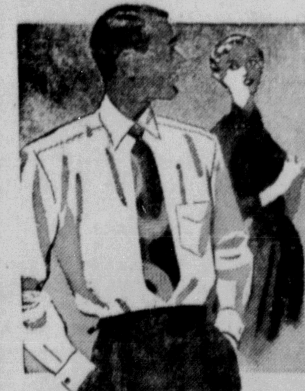
Fine, white Broadcloth shirt Smart, slotted spread collar

Par has a soft, widespread collar with keep-neat stays. And it looks so handsome with your Windsor-knot Arrow tailored of fine Sanforized broadcloth (shrinkage less than 1%). Miloga cut for body-tapered fit. Durable, anchored-on buttons. See the "Par" here today!