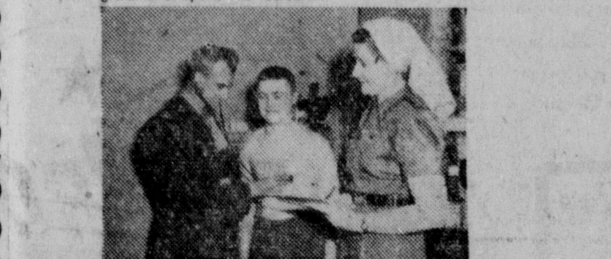
MEDICAL CARE. The finest medical and dental care ensures that the young men are kept in good health.