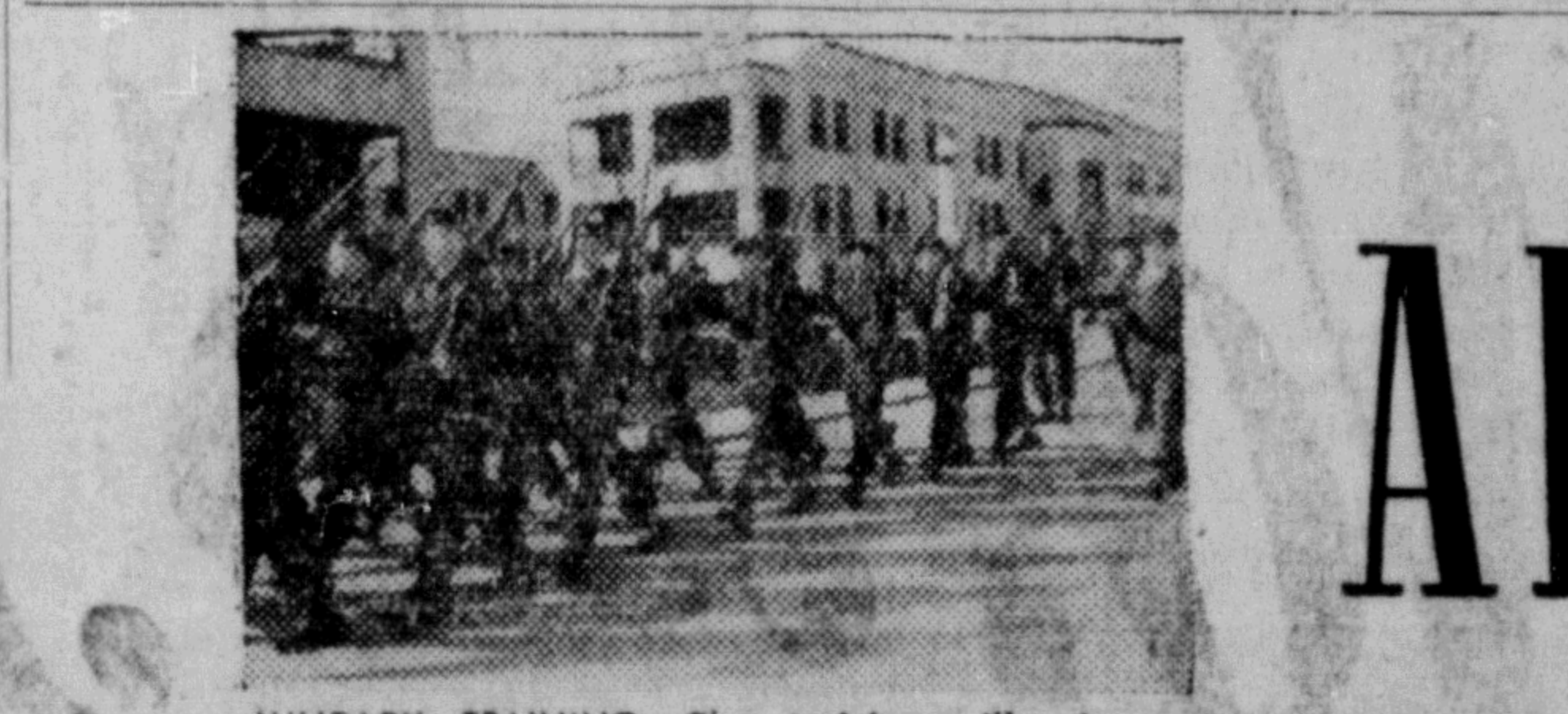
MILITARY TRAINING. The training will give a grounding in basic military subjects.

Familiarity Breeds TENDRING, Eng. (CP)—Two starlings are rearing their young in a nest they built in a scarecrow on a farm in this Essex district.