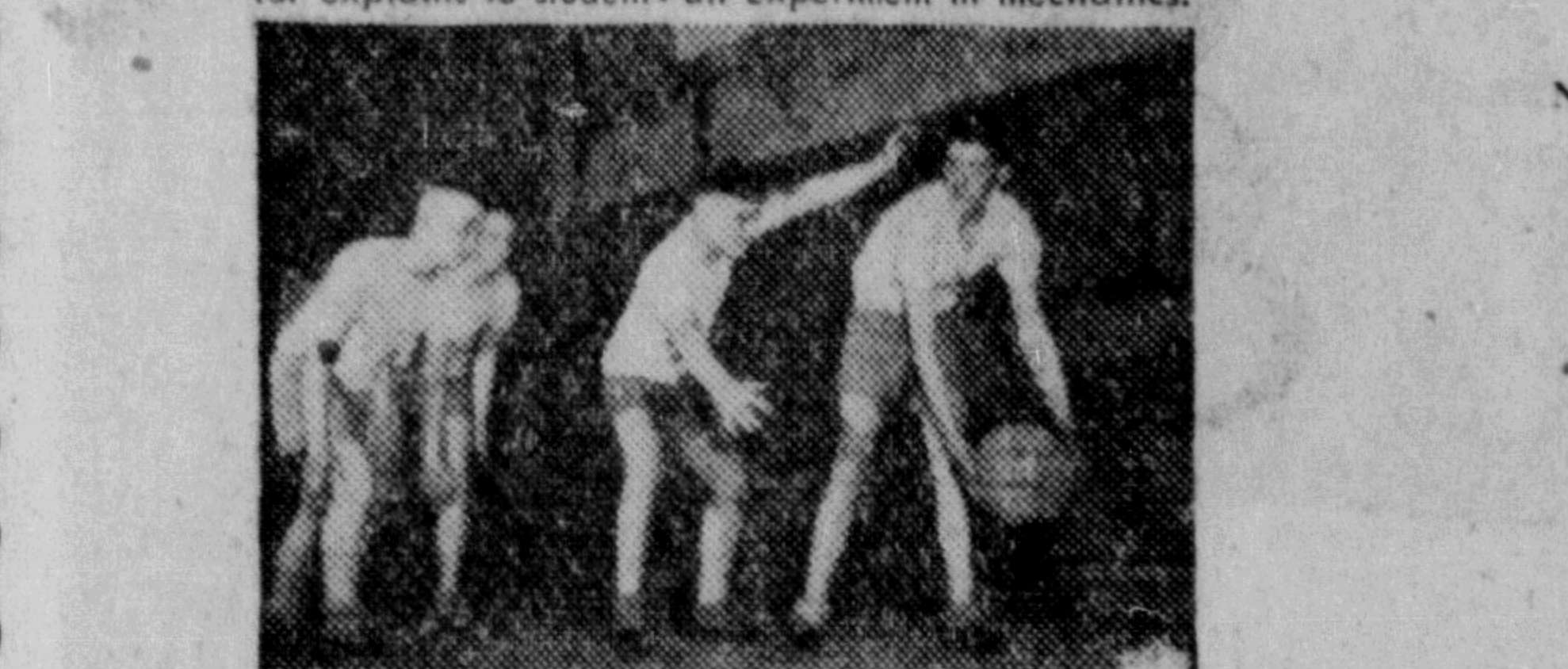
SPORTS AND RECREATION. A well-balanced programme of sports and recreation.