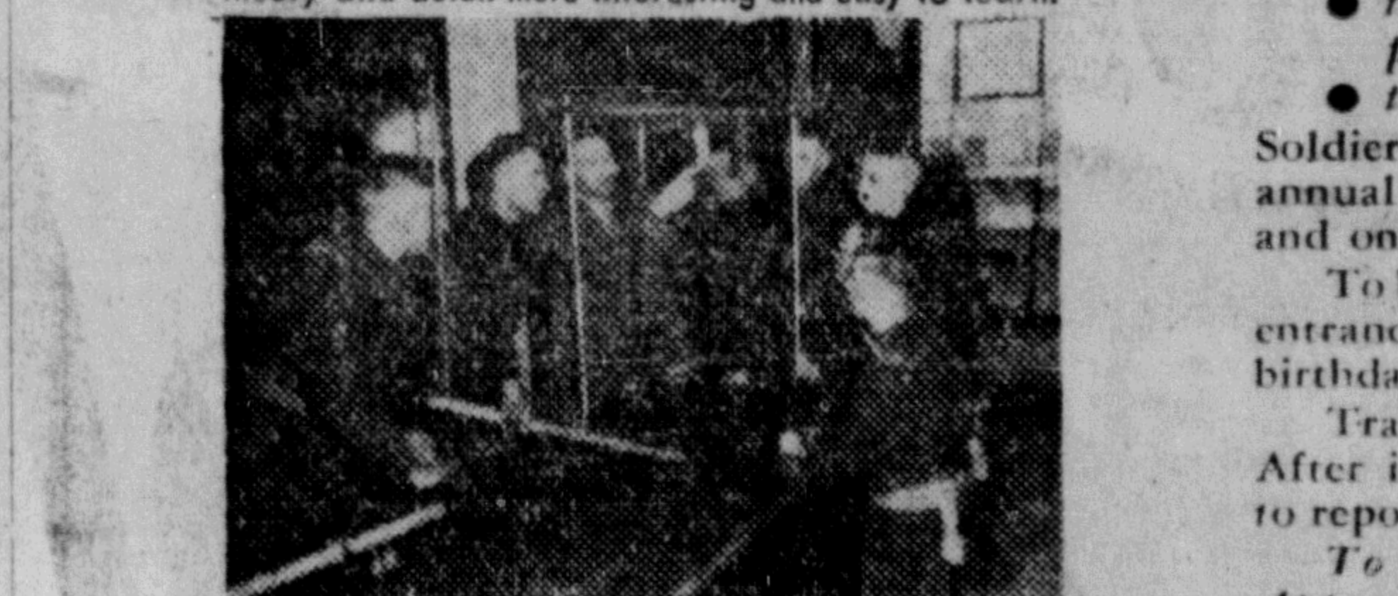
EXPERT INSTRUCTION. A civilian academic instructor explains to students on experiment in mechanics.