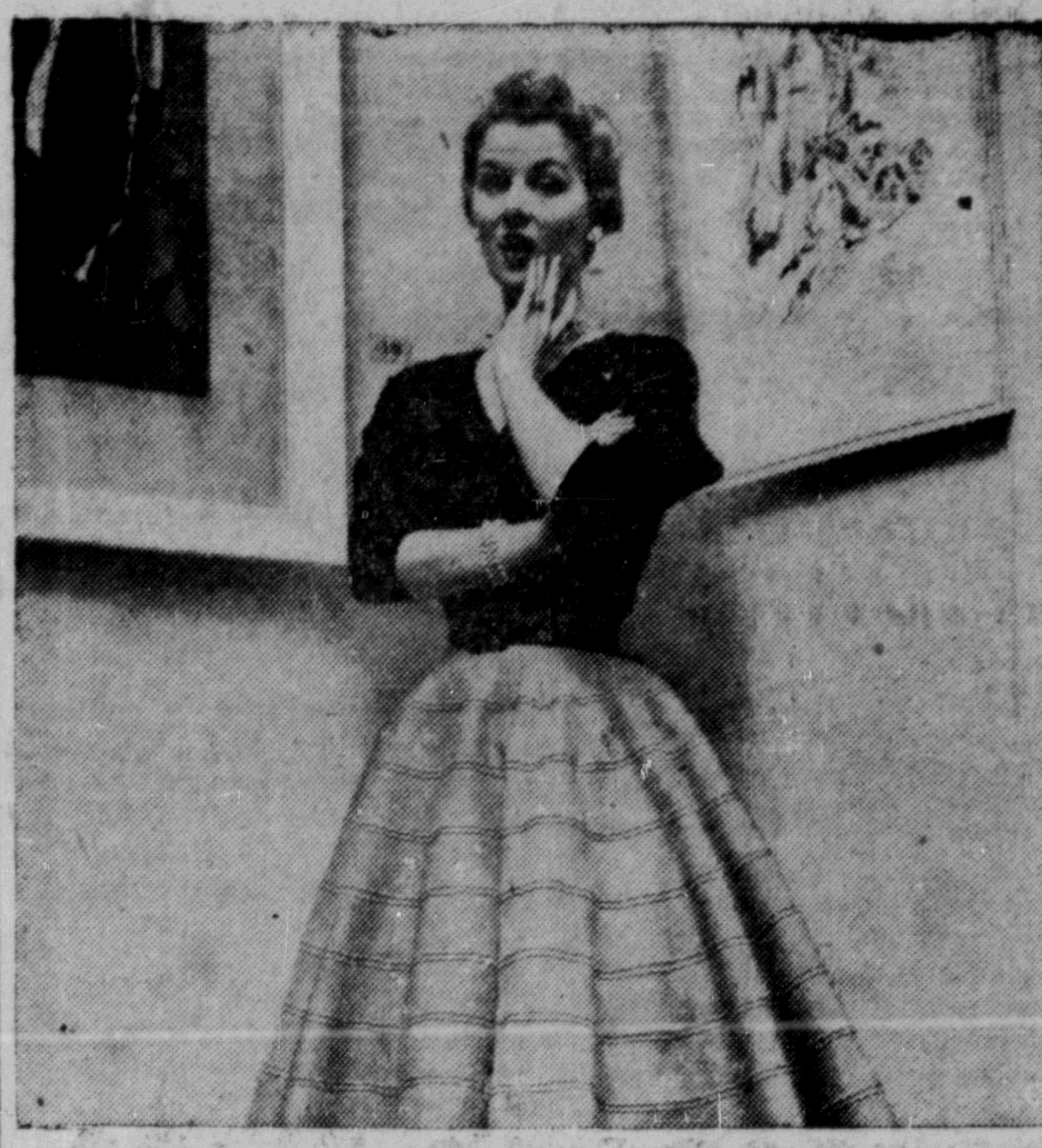
THIS SKIRT AND BLOUSE outfit is suitable for wear from early morning to late at night. The full-corded skirt is supported in its swinging fullness by a deftly-cut black wool jersey blouse.