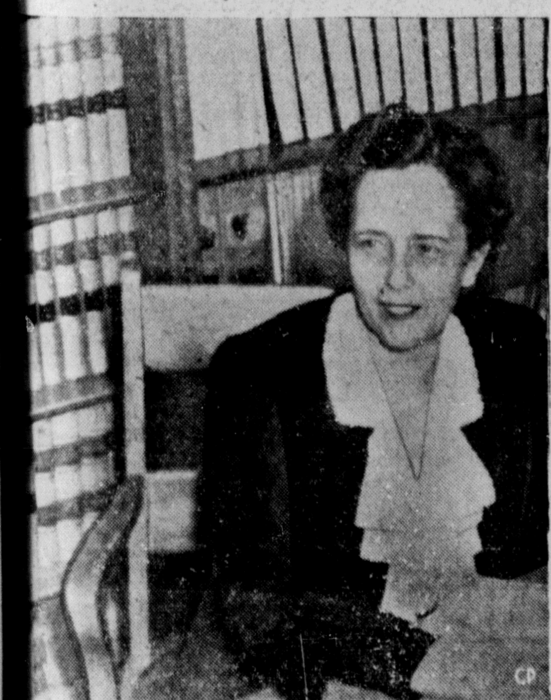
ATOR MURIEL FERGUSSON, 55, of Fredericton is a quiet crusader for women's participation in public life. The woman senator from New Brunswick, she previously was the woman judge of a probate court in the province and the woman Canadian enforcement counsel for the wartime trade board.

dark-haired and attractive, 53, the energetic, blue-eyed senator is a woman of the first woman senator in New Brunswick, first member of the Fredericton city council, first woman judge of probate in the province and first woman to have been ap-