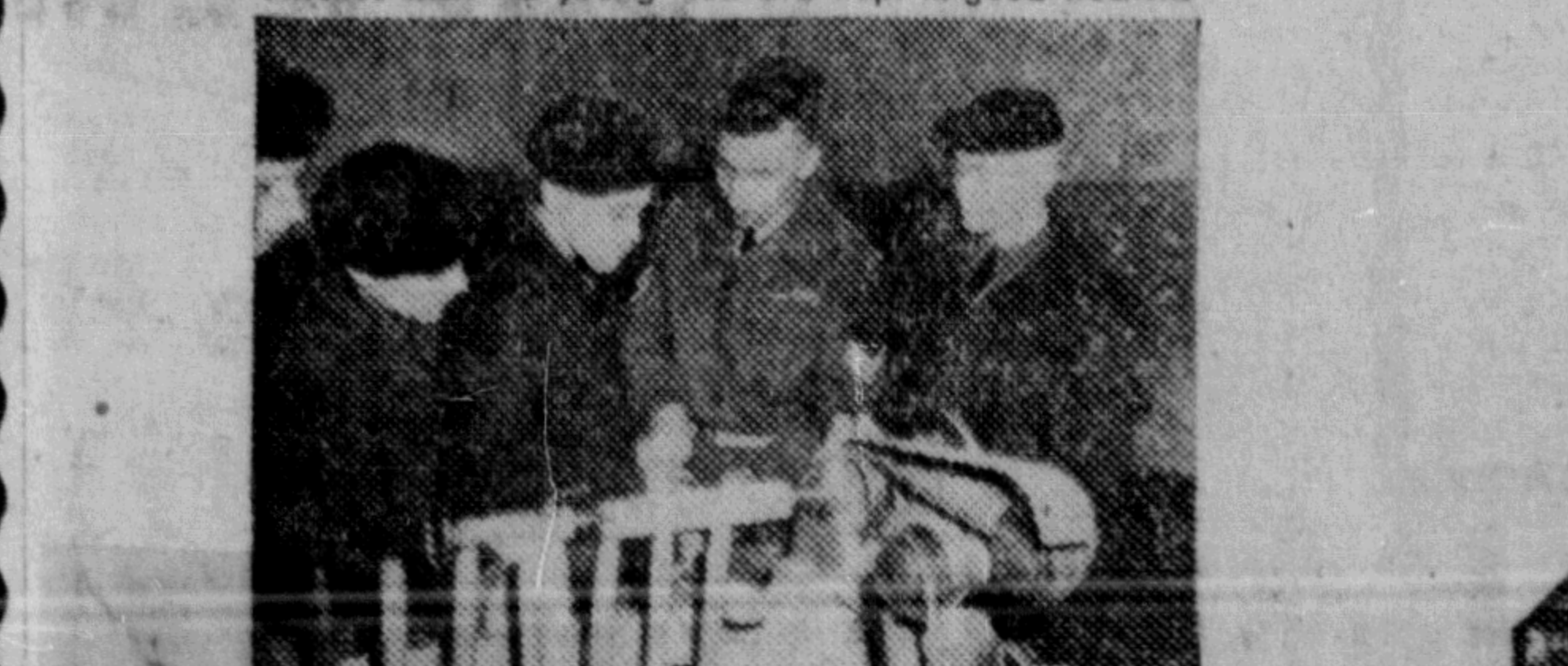
HOBBY SHOPS. For interesting and constructive ways to spend spare time.