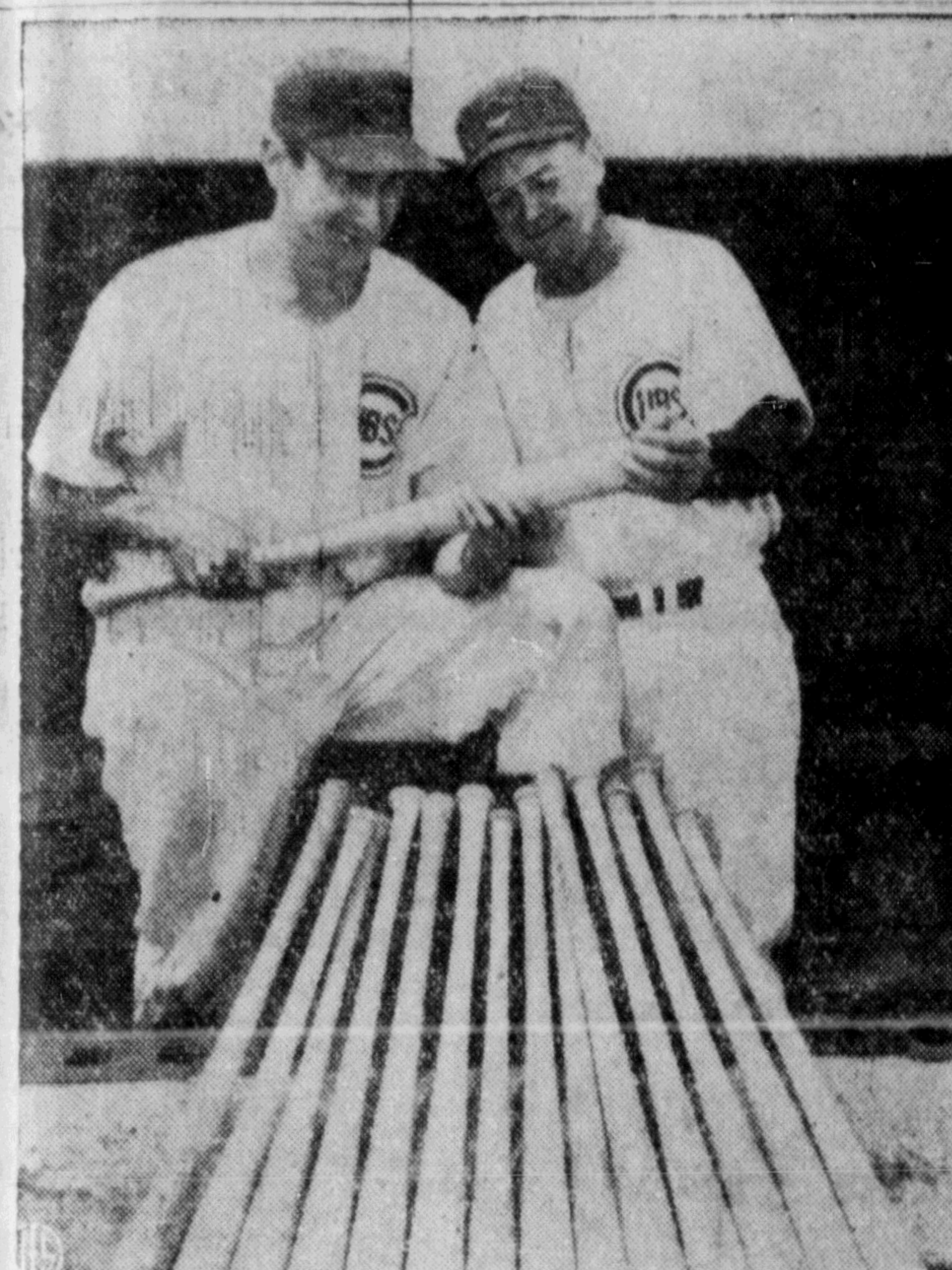
LEADING HIS LEAGUE in home runs and up near the top in runs batted in, Chicago Cubs outfielder Hank Sauer shows his manager, Stan Hack, the new, lighter bat to which he credits his classy batting accomplishments. Sauer, who used to swing a 40-ounce bat, now swears by the 37-ouncer.

Prince Rupert Daily News Monday, June 14, 1954