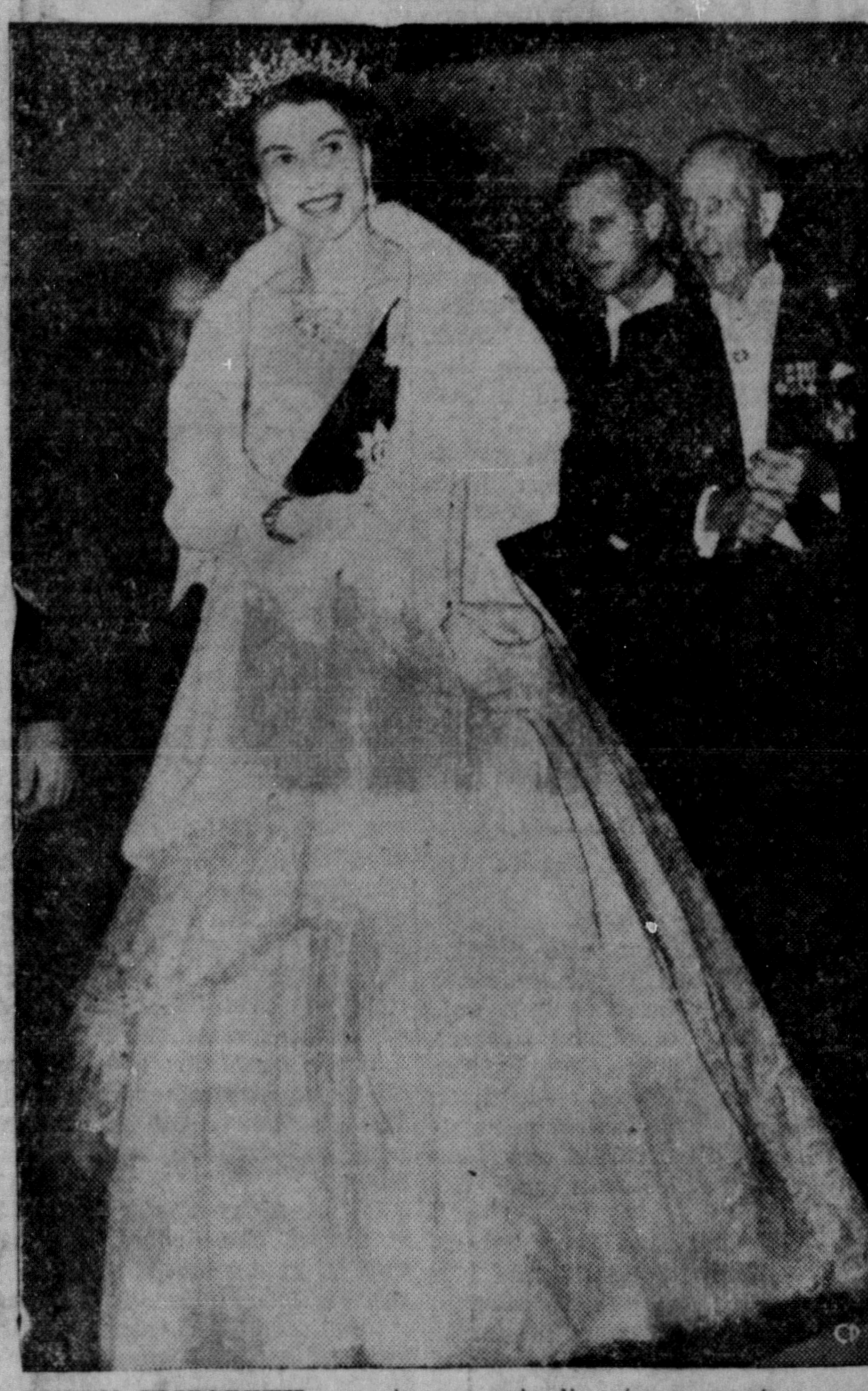
QUEEN ELIZABETH , wearing a crinoline-type evening gown with the ribbon of the Order of the Garter, attends a special concert given by Australian and New Zealand artists at the Royal Festival hall in London. The concert was a farewell gesture to the Queen and the Duke of Edinburgh (second from right) who leave next Monday on the Commonwealth tour.

One is a gas and bell buoy, close to Moorehouse Rock, painted with black and horizontal stripes, and the other a red conical buoy, close to Wilson Rock.