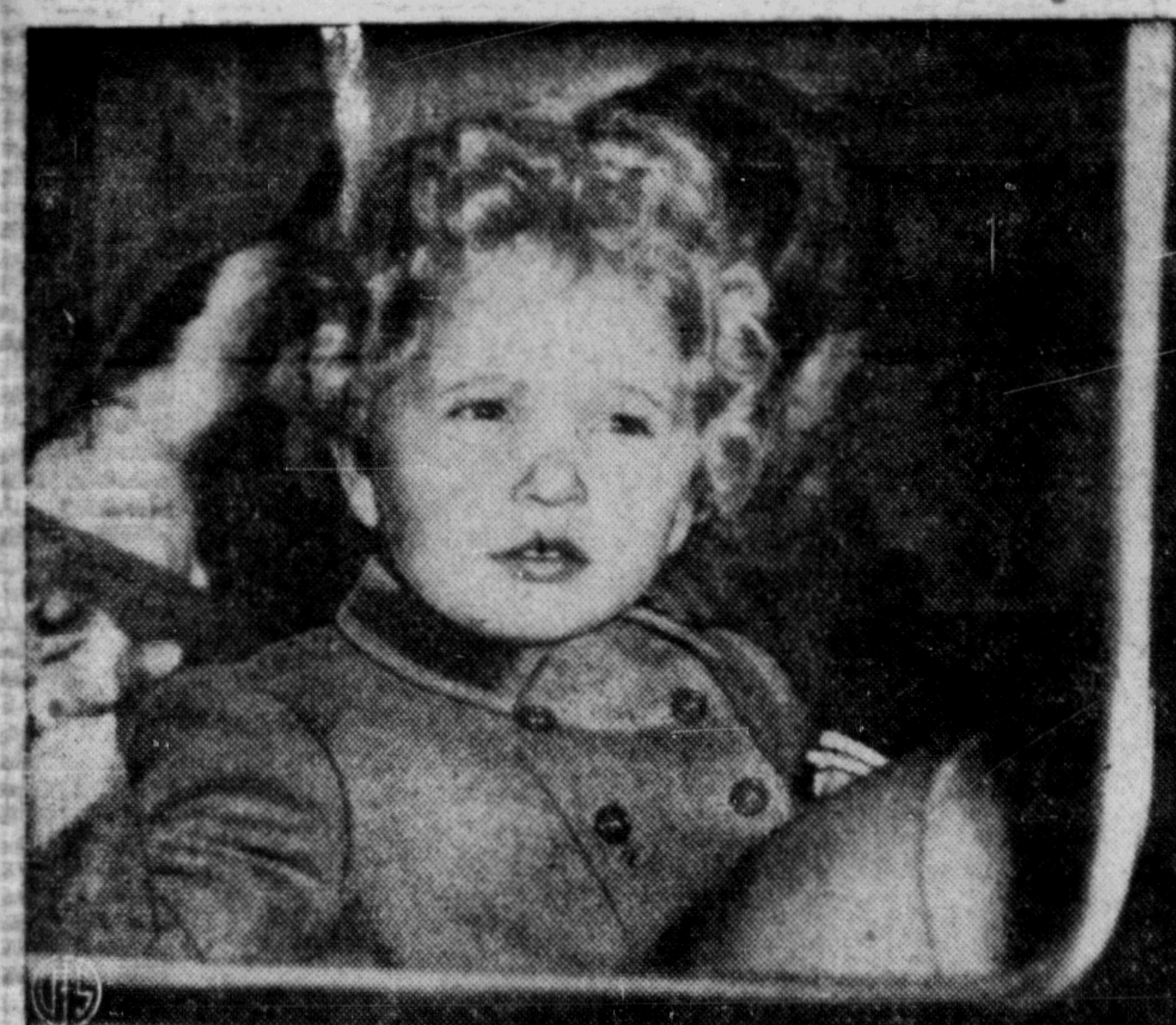
GOLDEN-HAIRED PRINCESS ANNE waves to subjects from an automobile window as she returns to Buckingham Palace, temporarily stealing the spotlight from her older brother, Prince Charles. The Prince, who has just celebrated his fifth birthday, is in the background with a nurse as the family of Britain's Queen returns from a drive in the country.