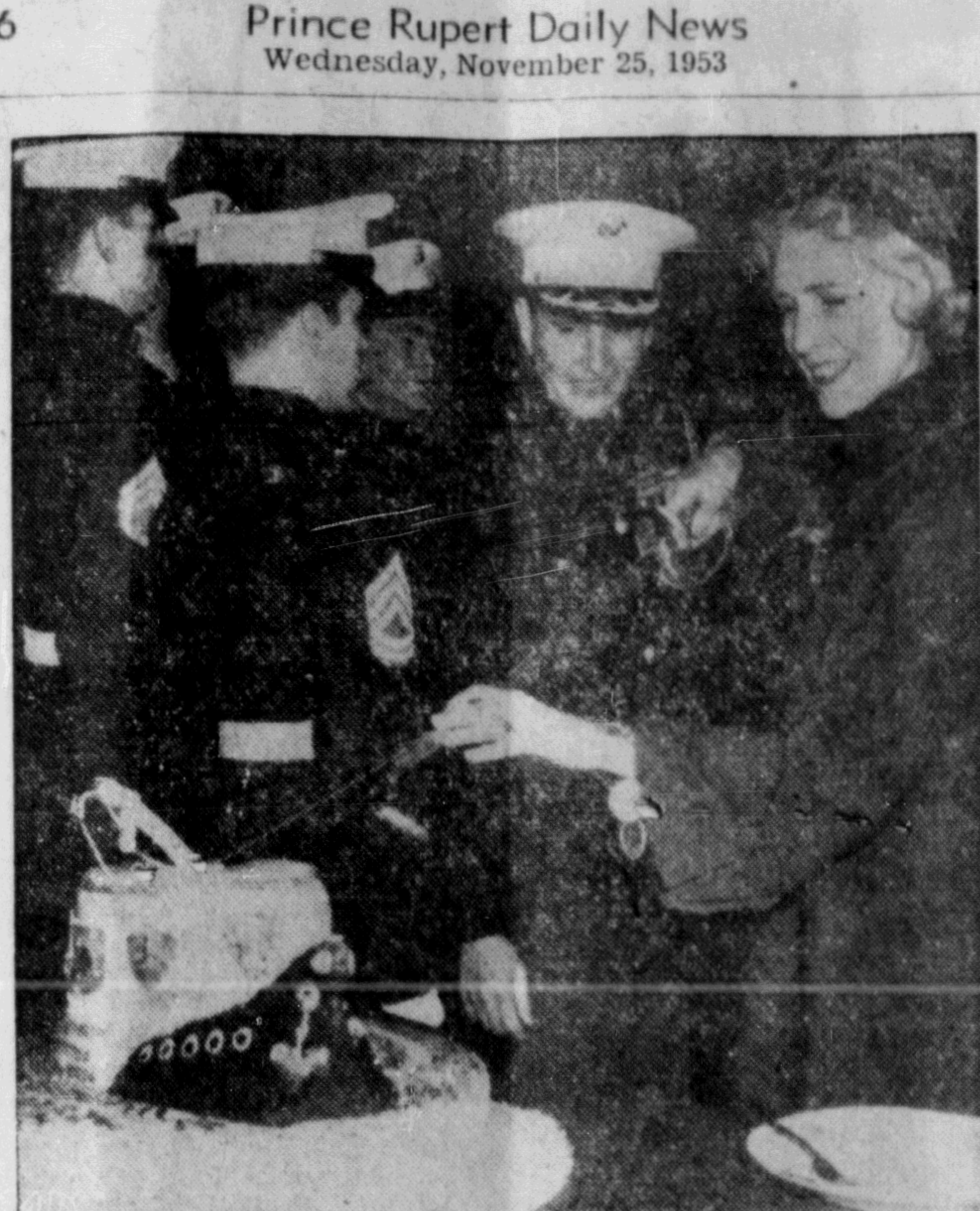
MRS. CLARE BOOTH LUCE, U.S. Ambassador to Italy, uses a long Marine sword to cut the ornate cake baked in honor of the 178th anniversary of the U.S. Marine Corps. Madame Ambassador joined in festivities at a small anniversary celebration held in the American Embassy in Rome.

Final results will not be disclosed officially until Wednesday.