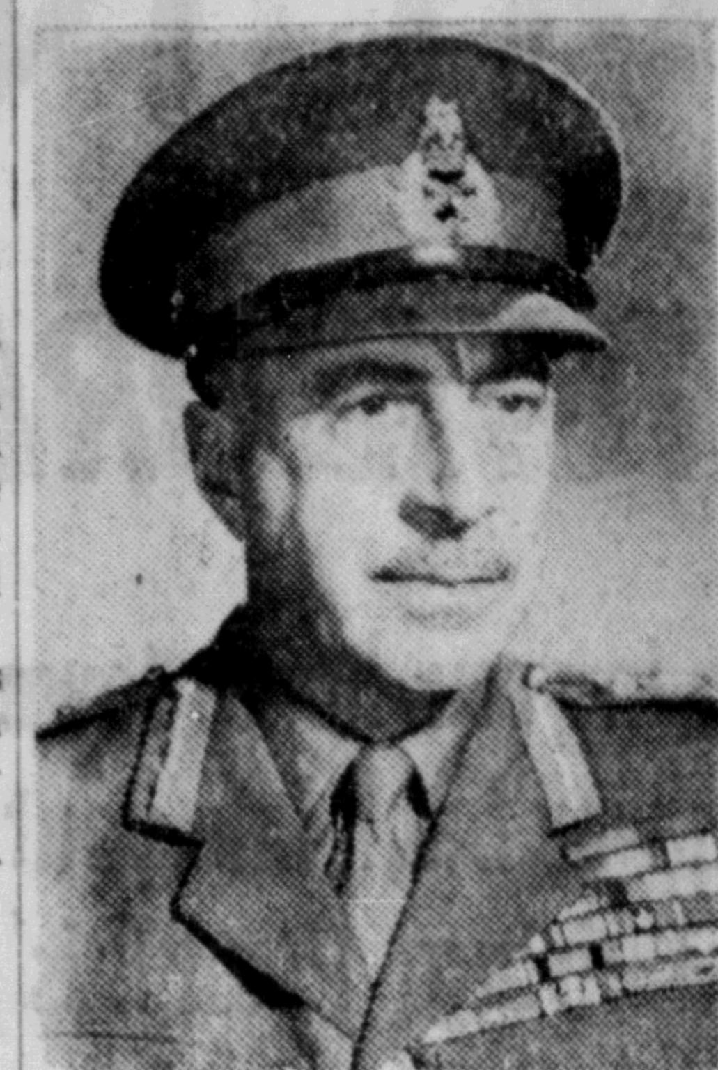
GENERAL H. W. G. CRRERAR, commander of the 1st Canadian Army during the Second World War, will represent the Canadian Government and the Canadian Army as the French Government's guest of honor at D-Day commemoration ceremonies in Normandy this year.

6 Prince Rupert Daily News Tuesday, May 19, 1953