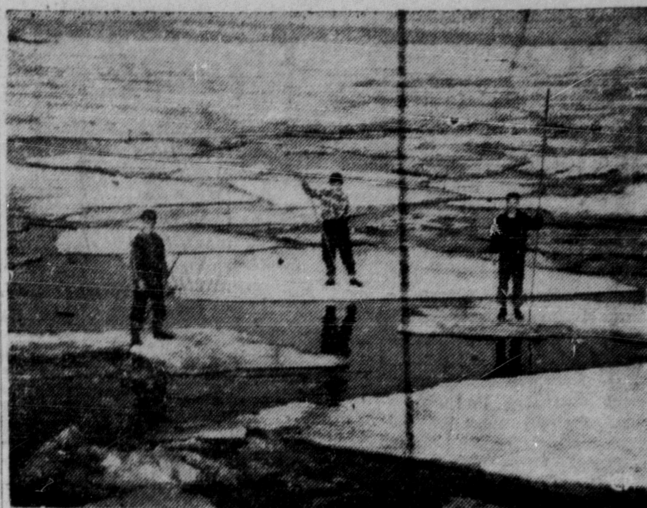
DARE YOU! —Spring fever doesn't mean giving way to laziness to these Quebec boys. They were discovered by a photographer on shore, 200 feet away, having a whale of a time jumping from one iceflow to another on the St. Lawrence River, midway between Quebec City and the Island of Orleans.

And we have more Used Cars at attractive prices BIG SPECIAL Terraplane Sedan—Any reasonable offer. Superior Auto Service Limited 1st Avenue West Phone Green 217