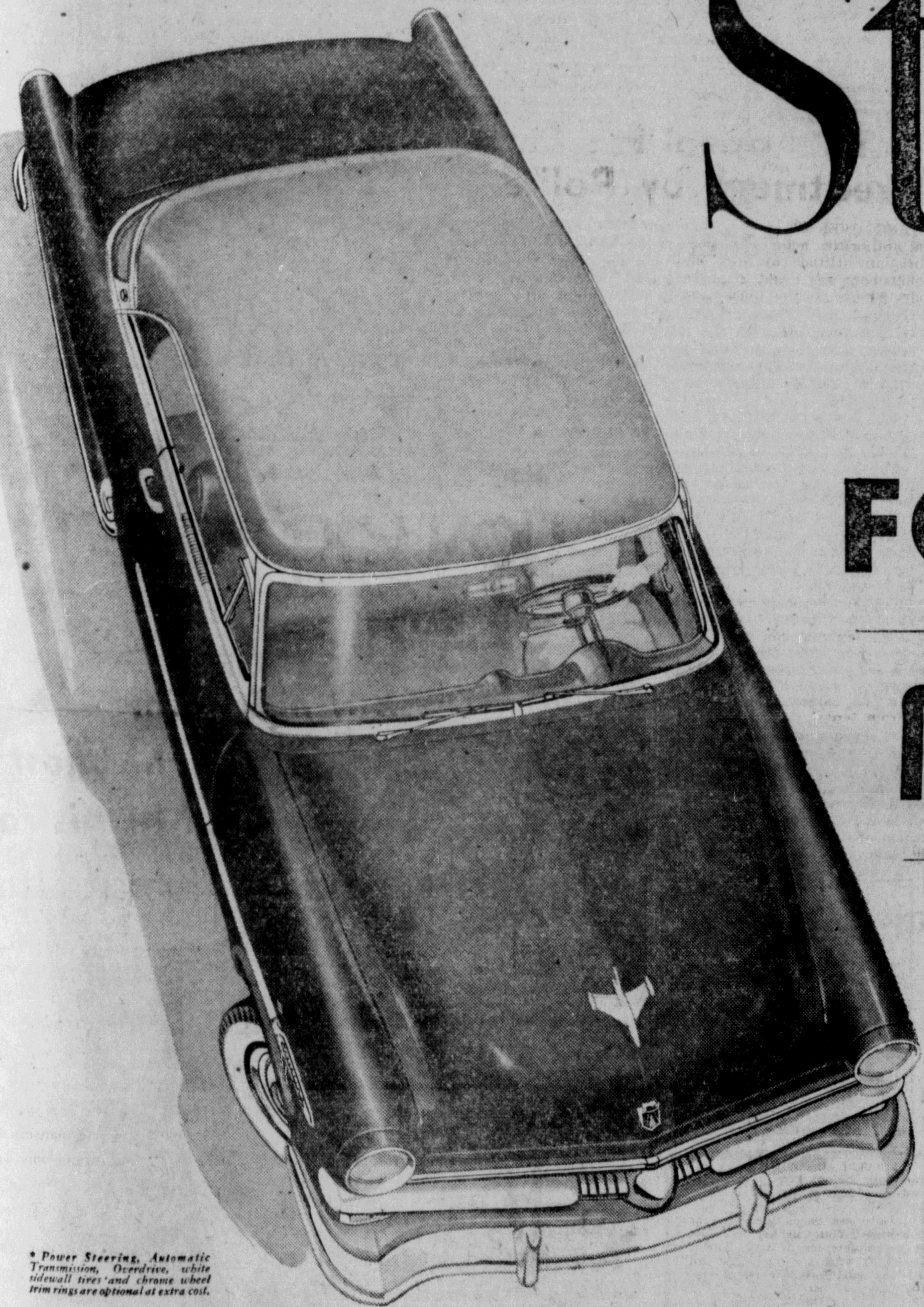
* Power Steering, Automatic Transmission, Overdrive, white sidewall tires and chrome wheel trim rings are optional at extra cost.