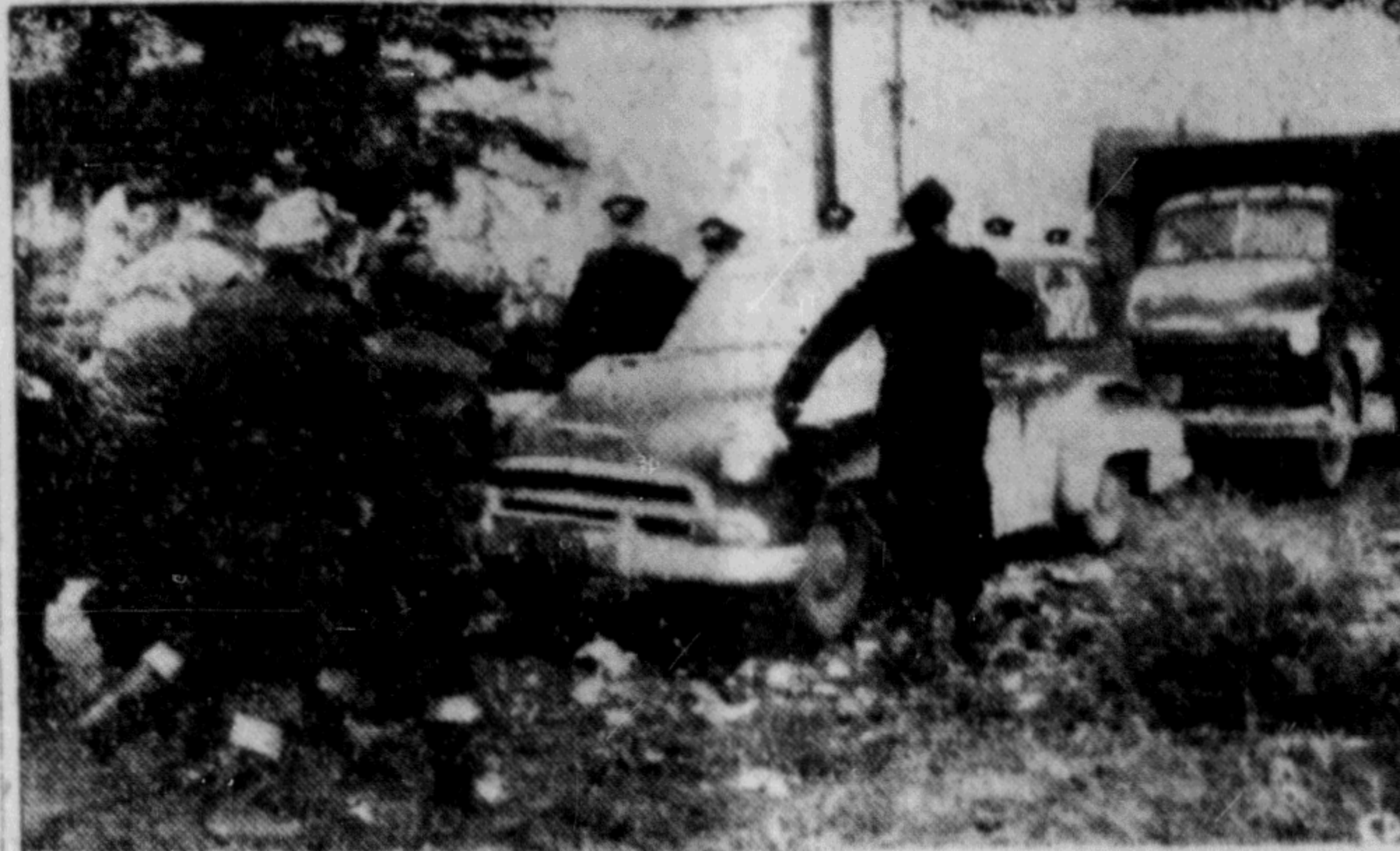
PICKETS AND POLICE BATTLE outside the strike-bound hatchery of Swift Canadian Company at Stratford, Ont. The truck in the background had 16,000 newly-hatched baby chicks which the company moved out after a scuffle with the pickets. The 61 employees of the plant went on strike for higher wages.

Malan's opponents broadly represent the interests of industries and big business. In general, there is the basis of the conflict in their race politics with those of the Nationalists, who mainly speak for Agrarian landed interests.