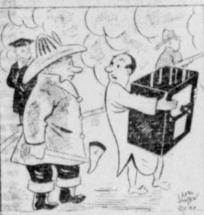
"Would you mind saving my Wife? I had to save my Radio."

Have YOU protected your Furniture and other personal property against FIRE? Many people add costly items of furniture and overlook having them insured. Get yours protected now.