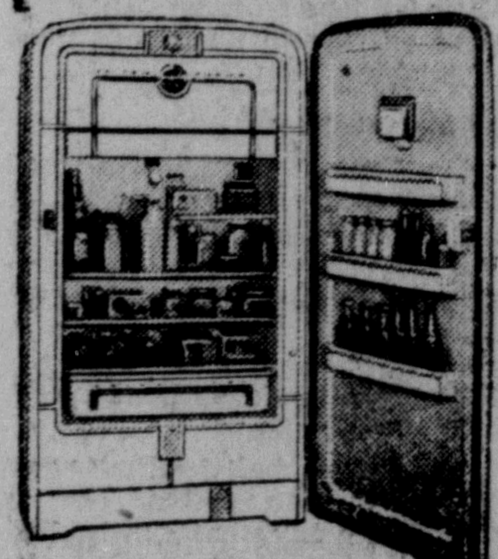
RCA Model DB Deluxe