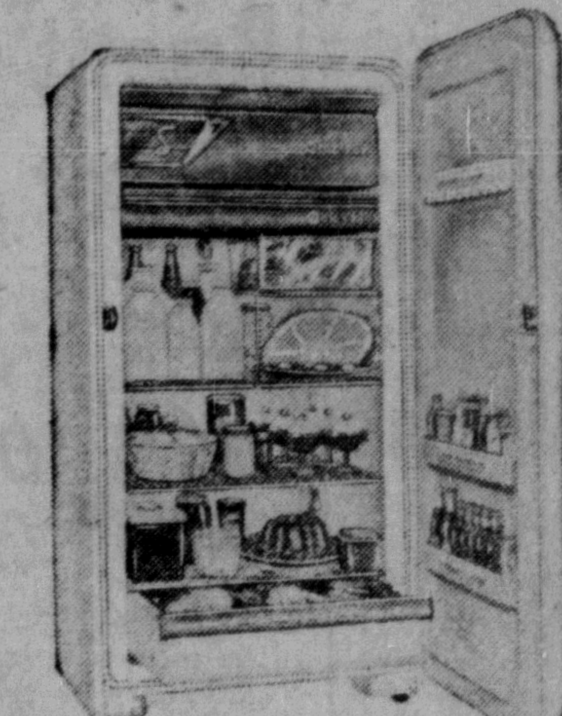
Dramatic new 7.4 cu. ft. Imperial Model H74C Quicfréz Refrigerator. Only