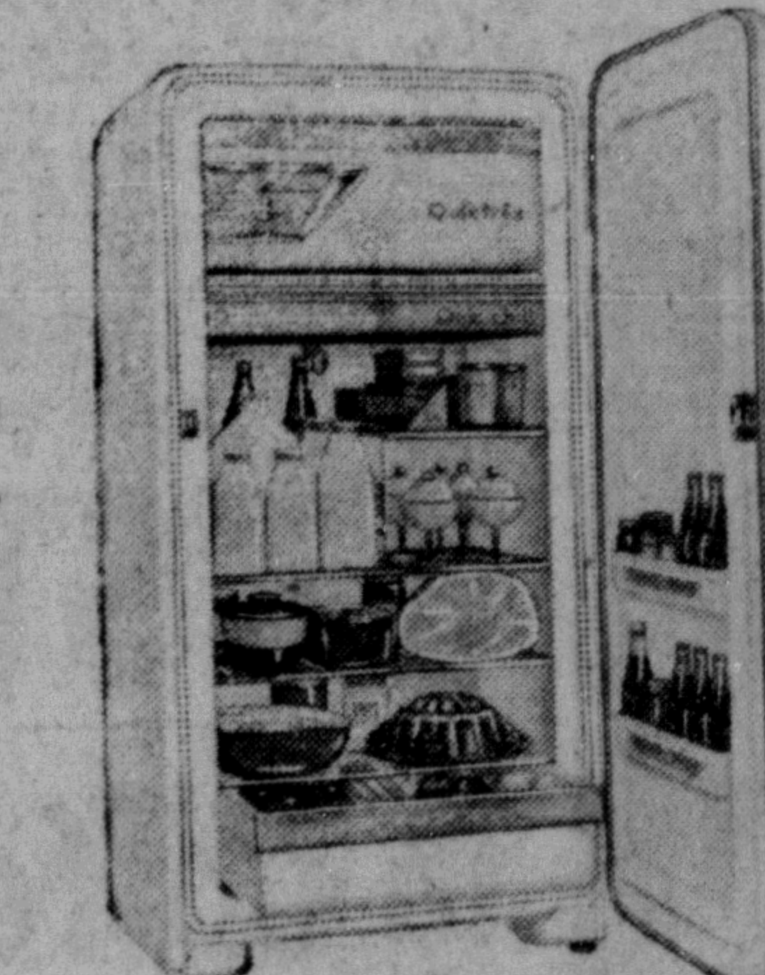
Colorful new 7.4 cu. ft. Stylized Model H74B Quicfréz Refrigerator. Only