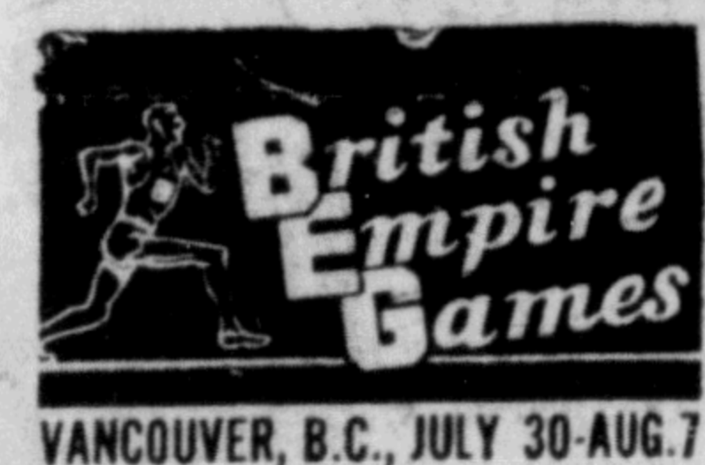
VANCOUVER, B.C., JULY 30-AUG. 7