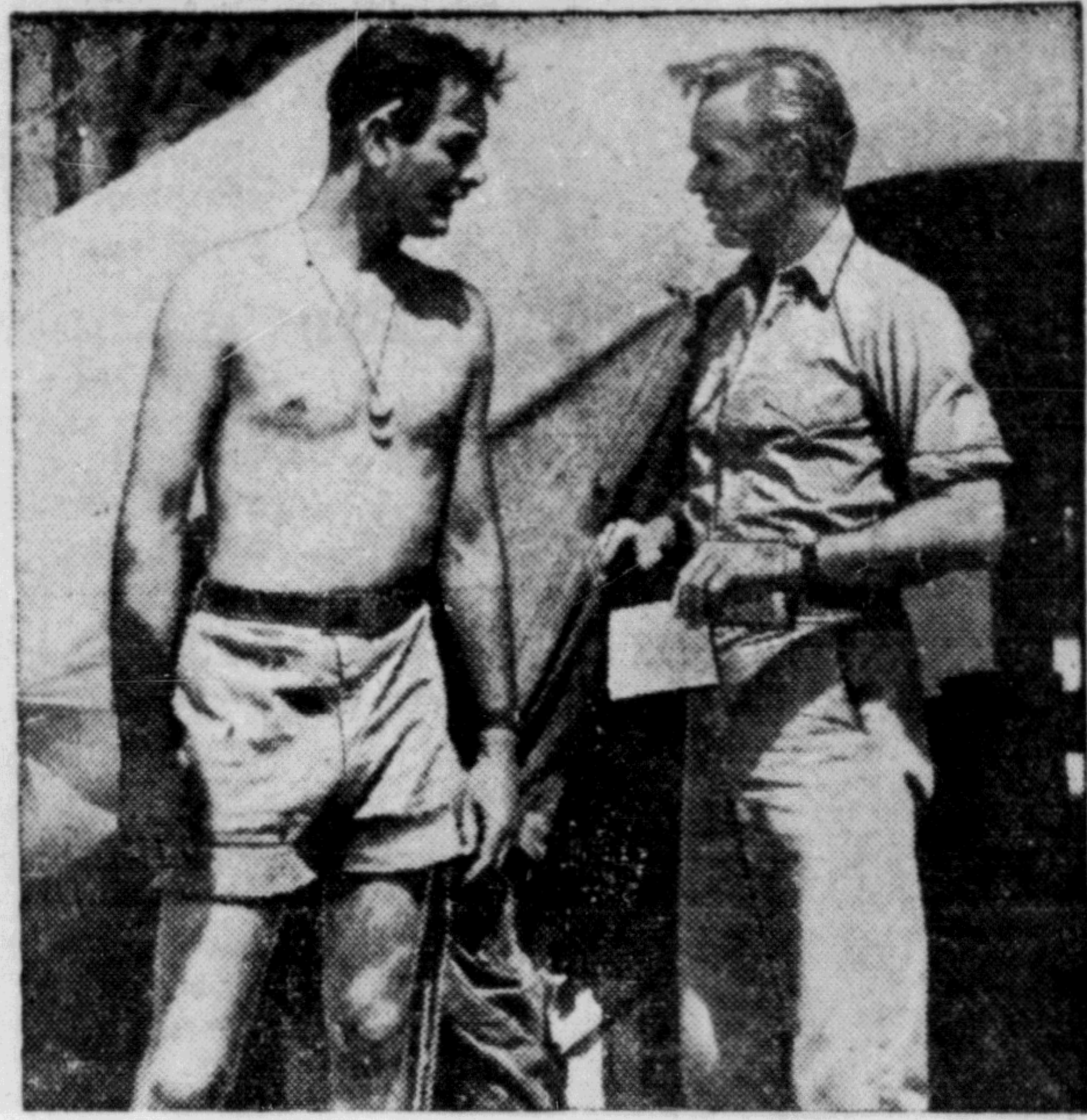
DON TAYLOR AND RICHARD WIDMARK co-star as Navy weathermen, a-reef in the shifting sands of an enemy-ridden terrain in "Destination Gobi," a strange and powerful tale of little-known Navy operations during the war with Japan. Filmed in stunning Technicolor, the Twentieth Century-Fox production opens tonight at the Capitol Theatre.

Greer & Bridden Phone 909 215 1st Ave. W.