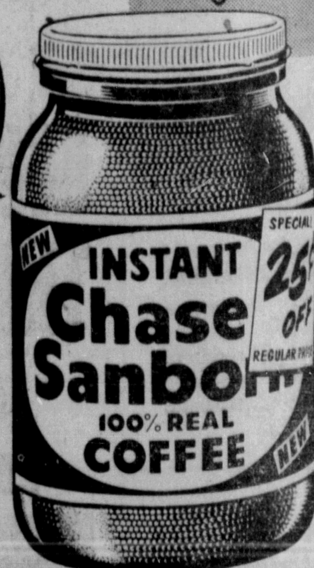
Large Economy Size