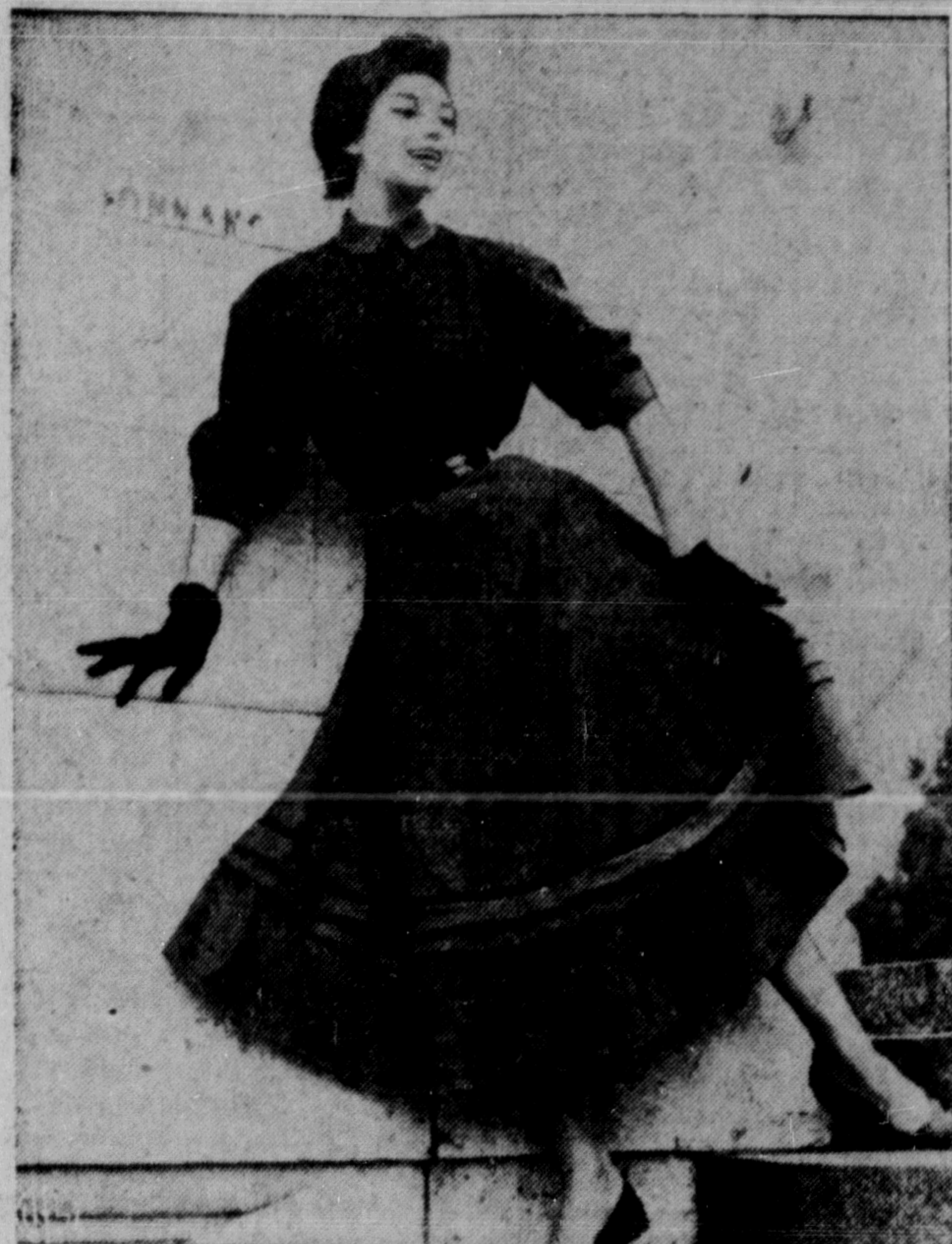
RED WOOL AND BLACK ALPACA strike a vivid note for fall in a two-part ensemble by Pierre Billet of Paris. The red of the skirt, which has horizontal tucking at knee level, is repeated at the collar and cuffs of the black, button-front blouse.