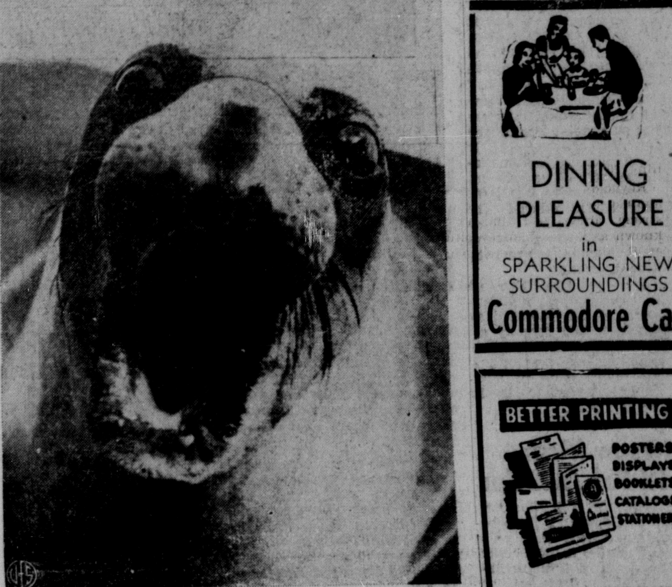
THE HEAT'S NOT THE ONLY THING bothering Madam Elephant Seal of Guadalupe Island, Mexico. By nature she's a very nervous creature—just like her hubby. Both of them have stomach ulcers—and this is nothing unusual. It seems that most elephant seals suffer from ulcers. This strange fact of nature was only recently discovered and is revealed in one of the latest Moody Institute of Science films.

Prince Rupert Daily News Wednesday, September 30, 1953