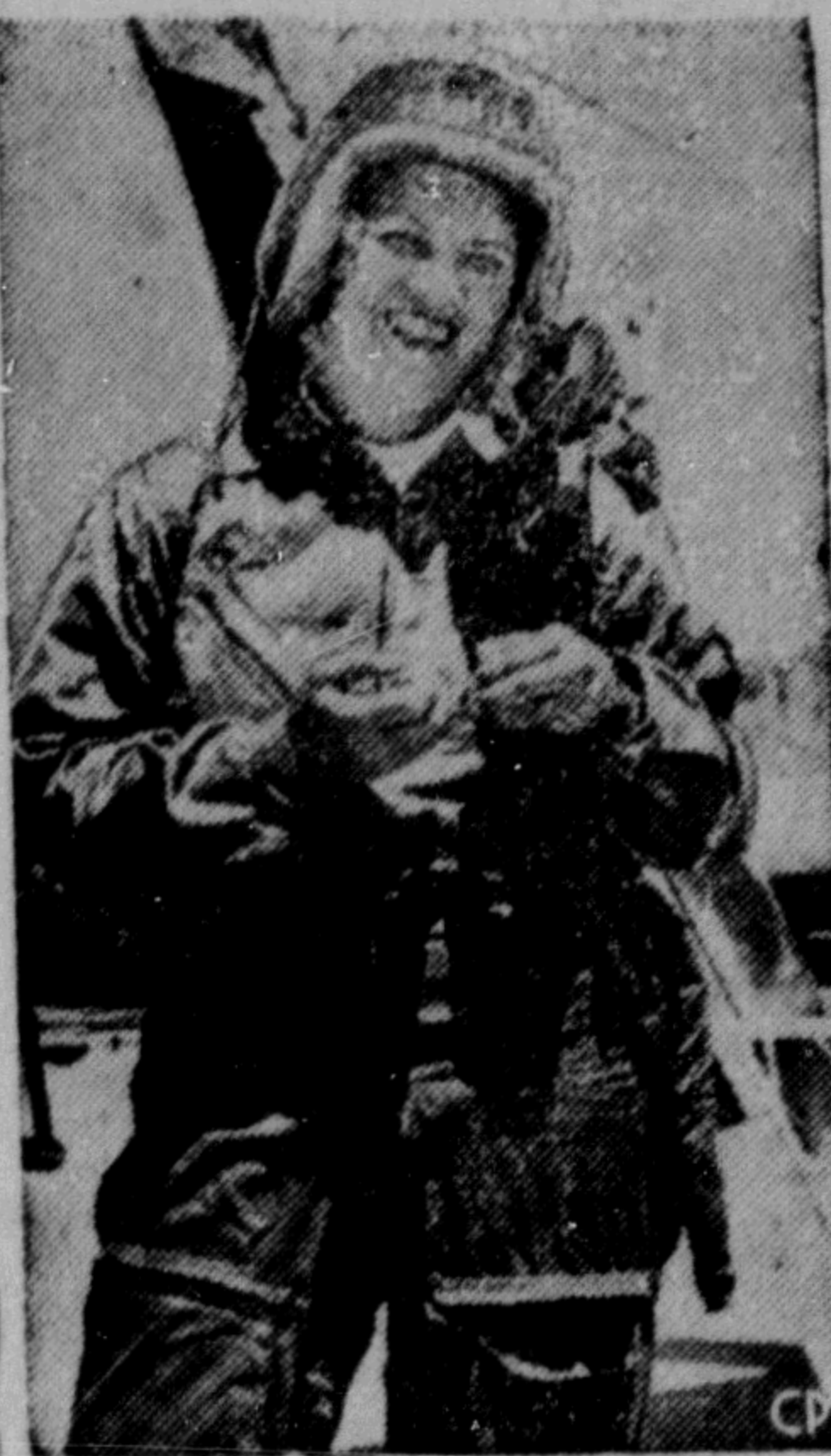
JET-PROPELLED Jacqueline Cochran, 43-year-old wife of an American millionaire, is the first woman to fly through the sound barrier. In an F-86 Sabre-jet built by Canadair of Montreal and powered by an Orenda engine, she flew at 652.33 m.p.h. over a 100-kilometre circuit to win not only the women's speed record but exceeded the men's record as well. She also defeated her rival woman speed aviator, Jacqueline Auriol of France, who previously had wrested the women's speed record from Miss Cochran.

It looks as though the Harmon Trophy will be on the Cochran sideboard again. But for how long?