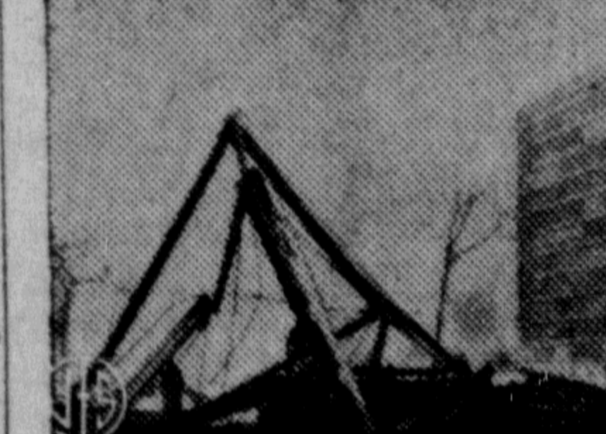
PULLED BY A CABLE attached to a tractor, one leg of an old 40,000-gallon water tank bends, throwing the tank off balance (top). Once started, there's no stopping the tank, which was 110 feet above a Chicago street atop an old building (centre). After the dust clears away, only a few twisted beams of the tank's foundation remain intact.

Princess "Worse" OSLO (Reuters)—The condition of Crown Princess Maertha of Norway, in hospital here with a liver complaint, worsened today and now is "very serious," according to a medical bulletin issued today.