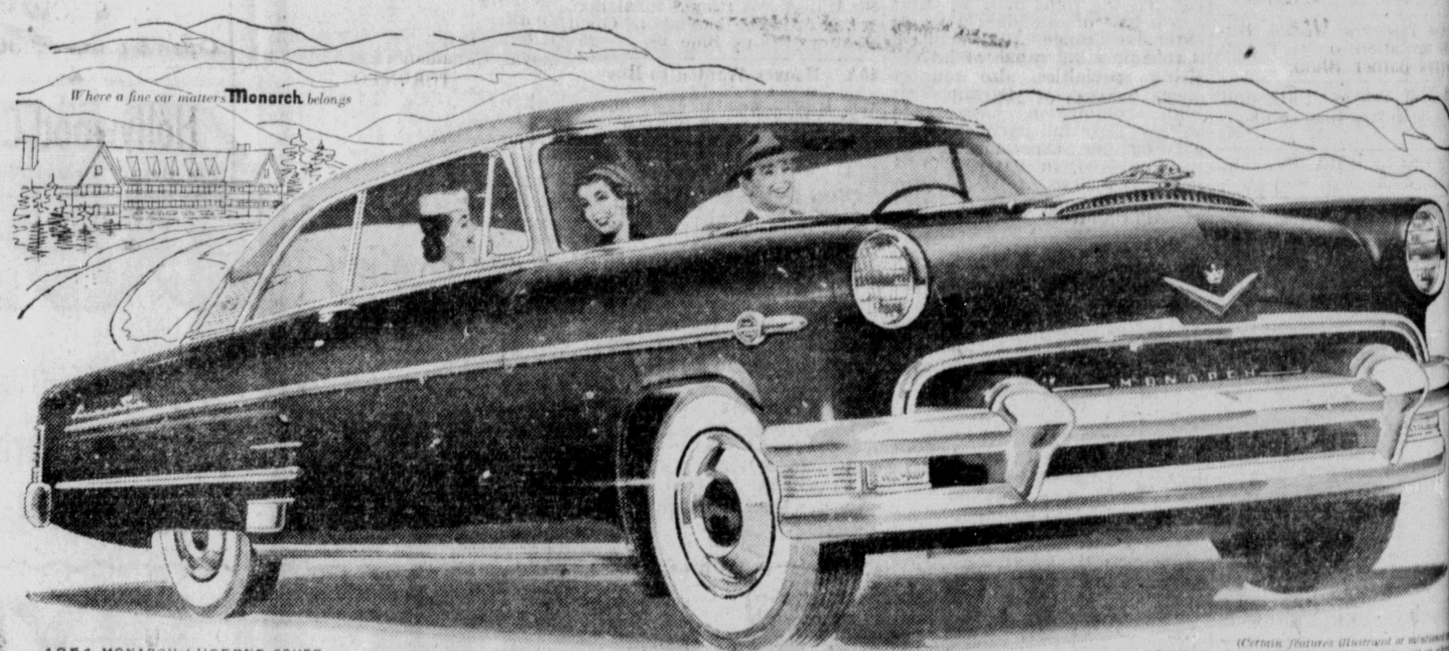
1954 MONARCH LUCERNE COUPE

by Canada's most experienced V-8 builder