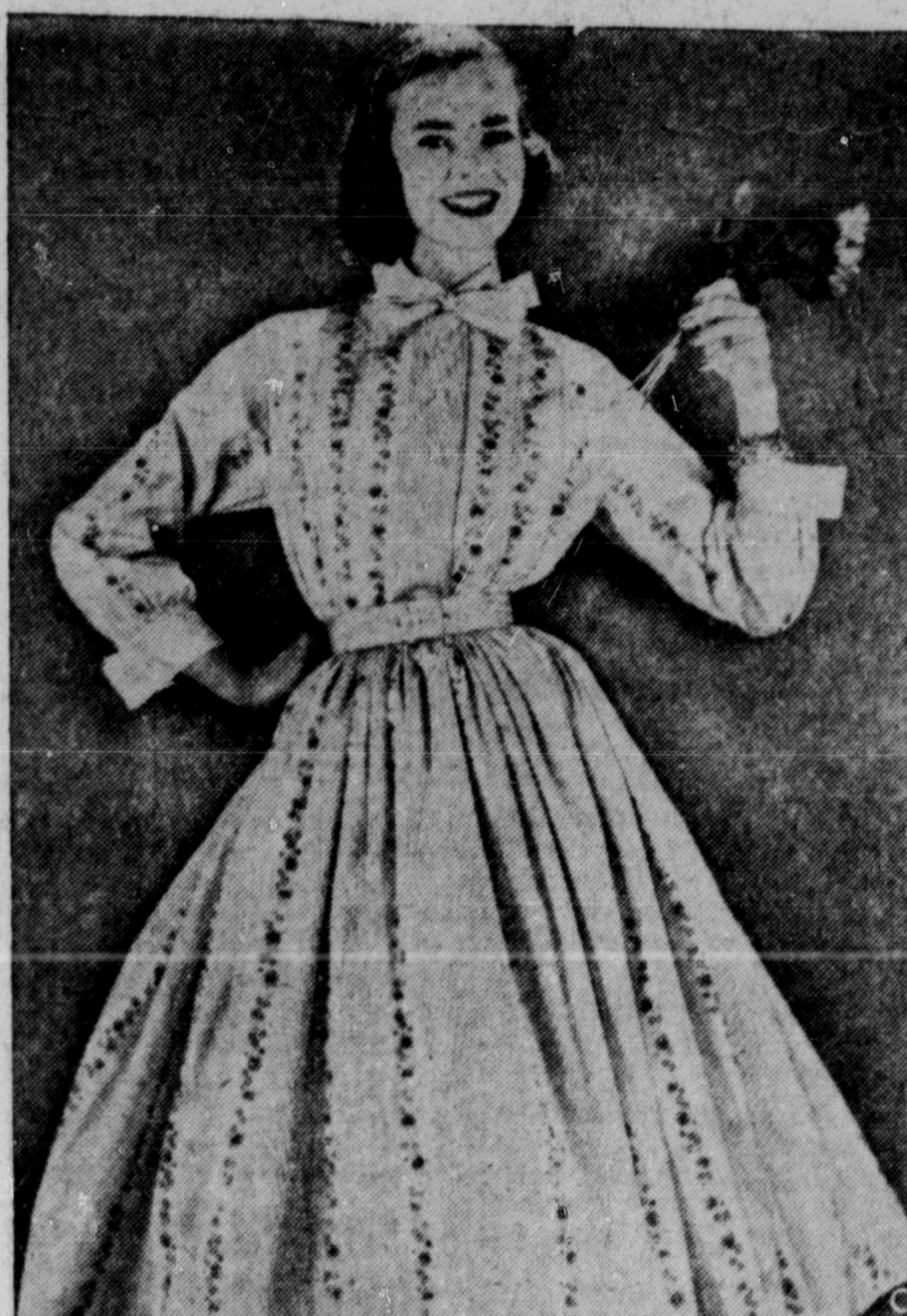
LONDON FASHION EXPERTS say the fabric choice of smart women in offices and Mayfair drawing rooms or at royal garden parties next summer will be cotton. This is a regency print in Sudan cotton poplin, with a crisp bow at the neck and long loose sleeves. It is featured by a number of leading London couturiers.

Meeting of Norway whist and dance, Jan. 15, Whist, 8 p.m. Dance, 10 to 2. Music by Colussi. Everyone welcome. (12)