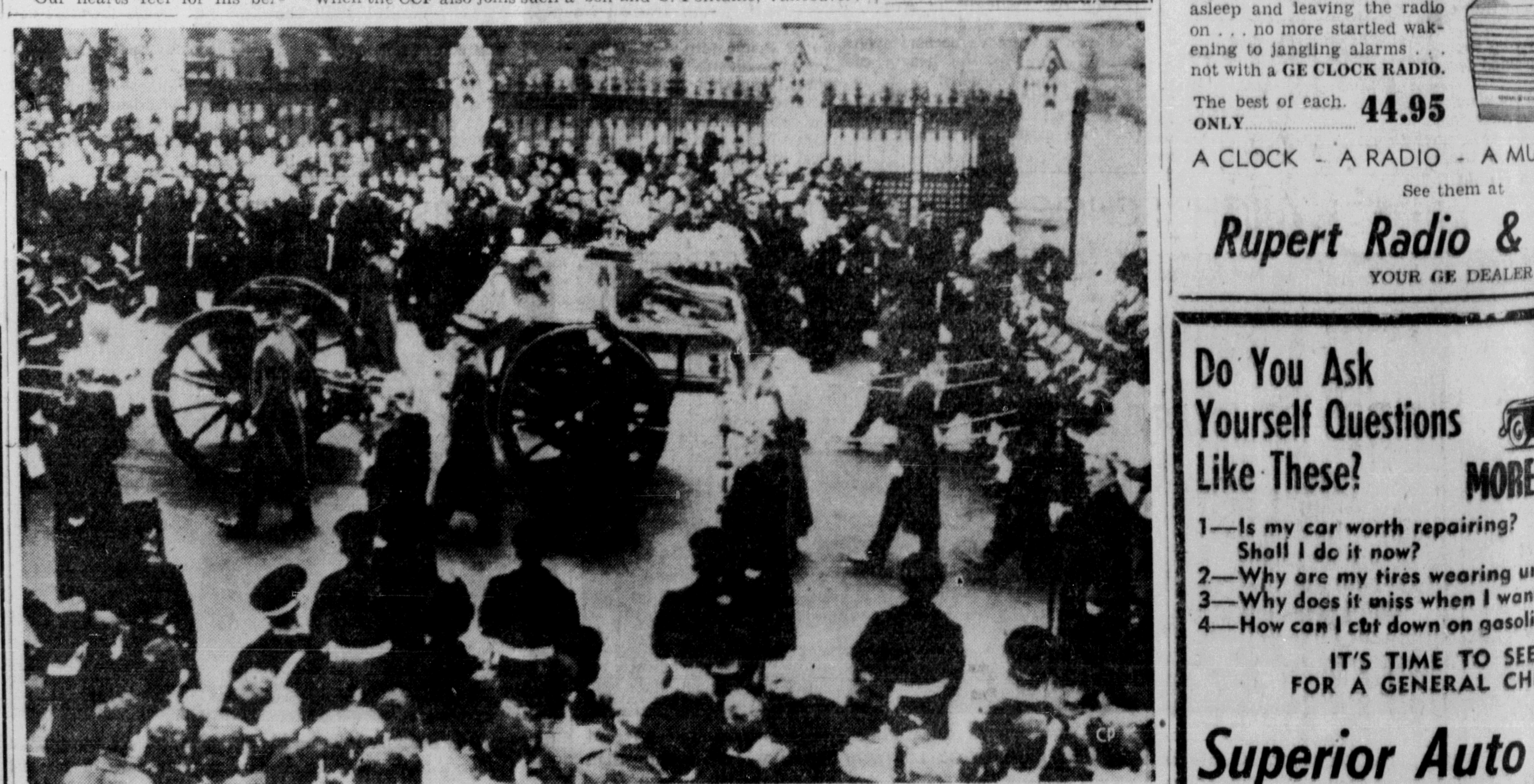
BORNE TO FINAL RESTING—Sailors of the Royal Navy draw the gun carriage bearing the body of King George VI from London's Westminster Hall to final ceremonies at Windsor Castle.