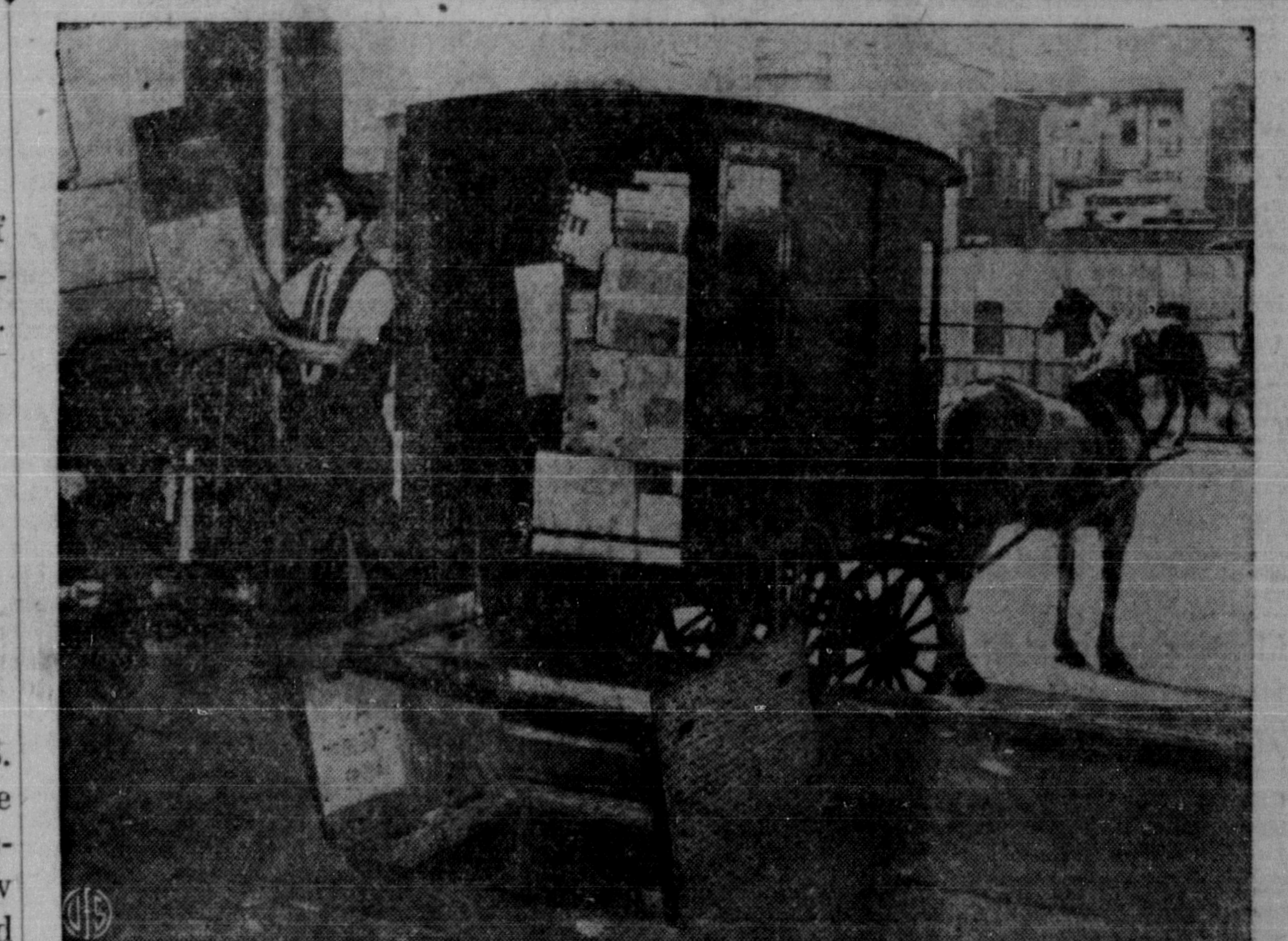
NO STEP BACK IN TIME, for this picture was taken just a few days ago, and the locale is not some small town, uninfluenced by progress, but the metropolis of Philadelphia. A postal worker loads mail into a horse-drawn wagon which will deliver it.

Forecast North Coast Region — Cloudy with a few showers today and Sunday. Sunny periods in sheltered localities both afternoons. Little change in temperature. Winds west 15 today, southwest 15 on Sunday. Low tonight and high Sunday at Port Hardy and Prince Rupert 52 and 63, Sandspit 53 and 65.