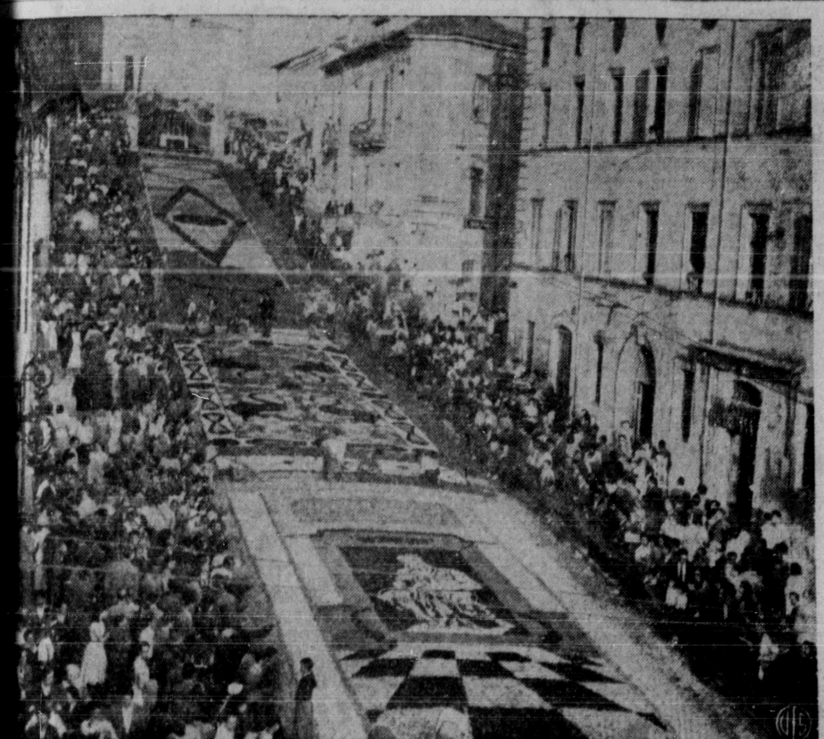
STREET IN GENZANO, ITALY, is in flower, each year, for the Festival of Corpus Christi. The whole town turns out to arrange or admire a mile-long display of floral designs. The street is blanketed, from one end of town to the other, with exotic paintings done in flower. Local artists, competing for prizes awarded at the close of the feast day, use tons of red flower petals to make the beautiful display.