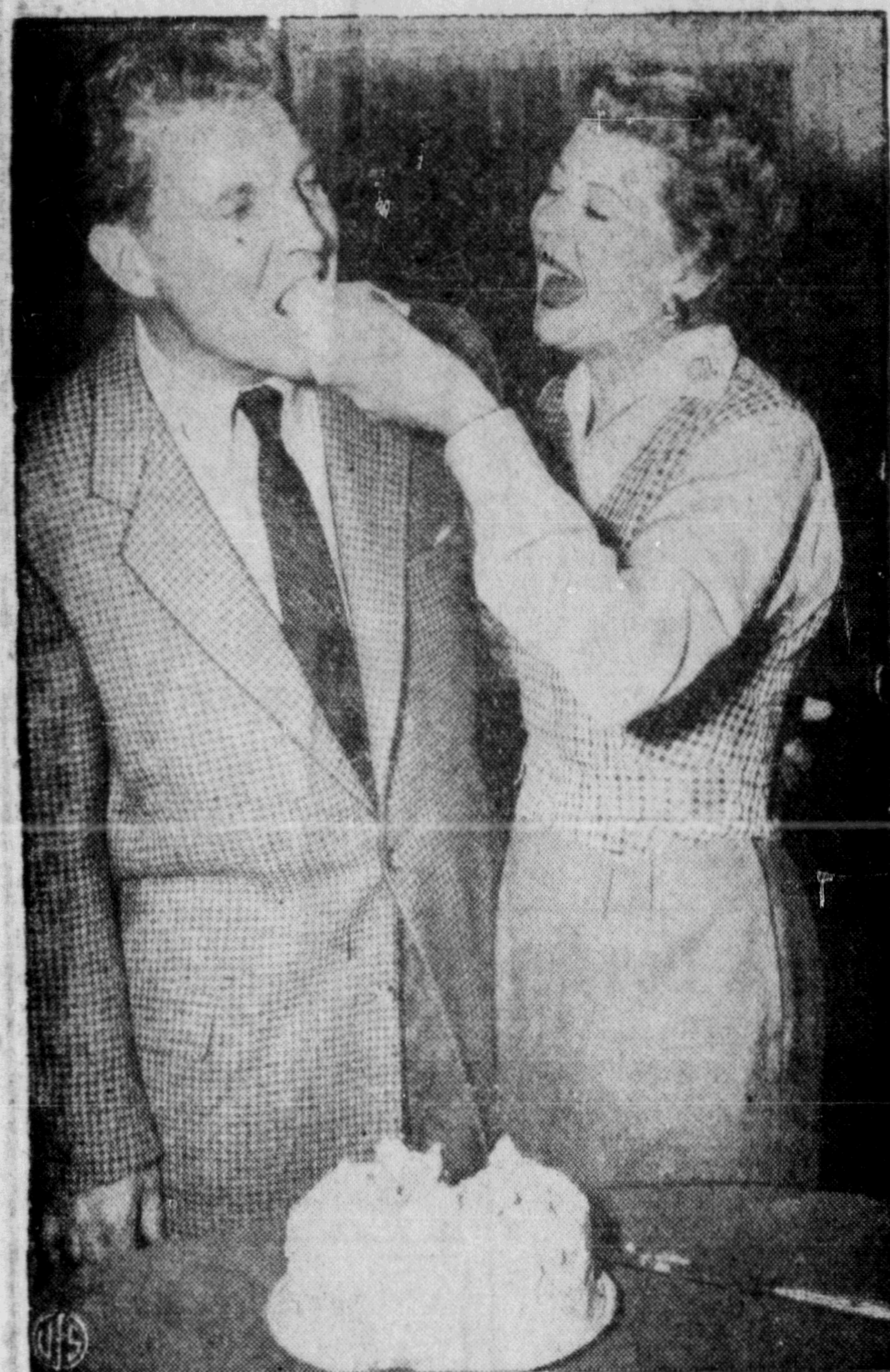
OZZIE AND HARRIET NELSON, real-life family twosome of radio and television, share a piece of cake marking their 18th wedding anniversary. The event coincided with the start of the tenth year of their popular radio program.