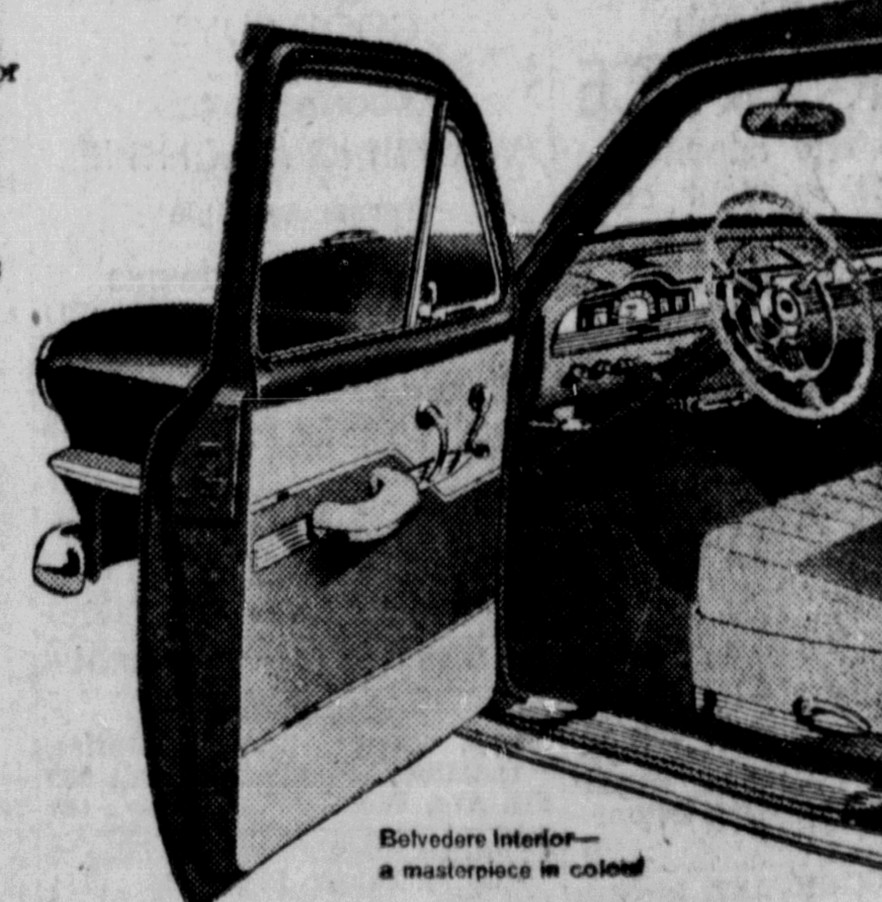
Beldere Interior—a masterpiece in color