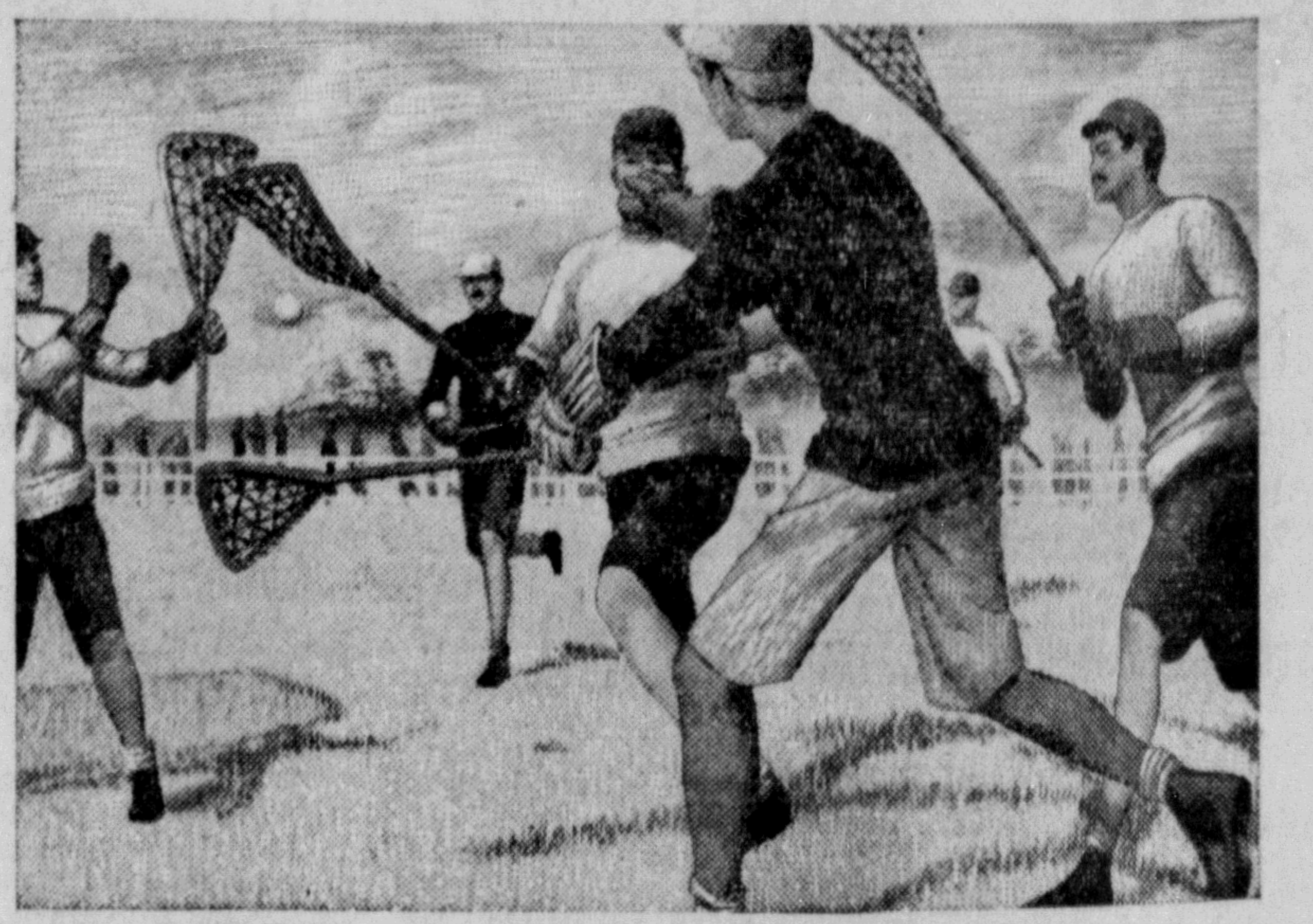
In 1908, the New Westminster lacrosse team—later the famous "Salmonbellies"—became the first team to win the Canadian Lacrosse Championship.