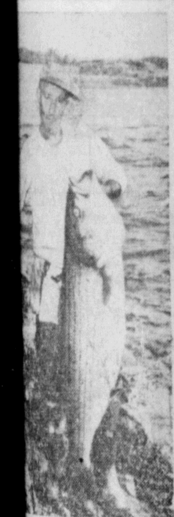
many a fishing fan, brother of Middletown, won't have to keep his crossed when he swaps with fellow anglers. Using reel, he landed this striped bass off RI. It's the largest of its kind to be taken in the area in the years.

will learn that each full-member of the winning as mailed a cheque for which is more than a whether big league players for a full season's ef- Those who were away on trips at the time also able to find that each