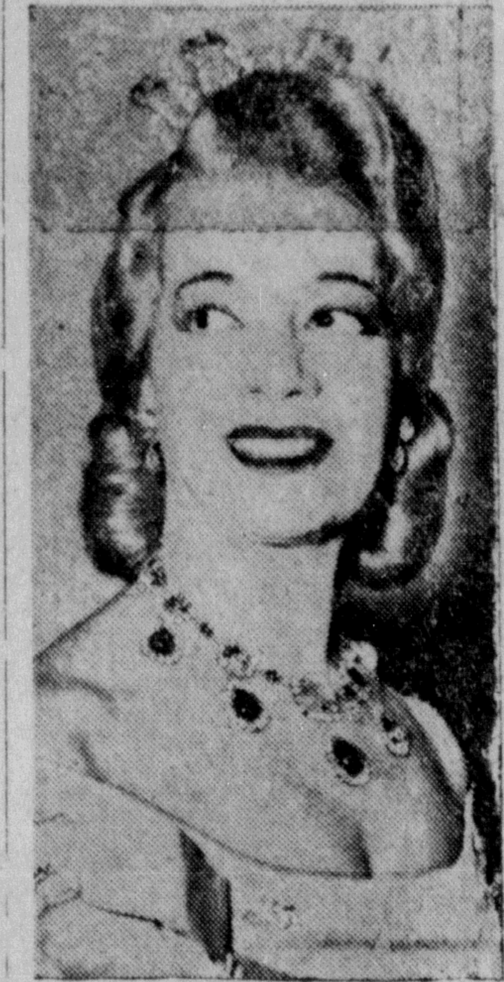
LILY PONS starred in the opening night production of "Lucia di Lammermoor" by the Metropolitan Opera Company before 9,100 patrons at Maple Leaf Gardens in Toronto. The company made a one-week appearance at the Gardens.

• Pony League meeting, Civic Centre, Wednesday, 8 p.m. Volunteers wanted to form working committees — grounds, equipment, umpires, and score keepers. We need more help. All interested please attend. (11)