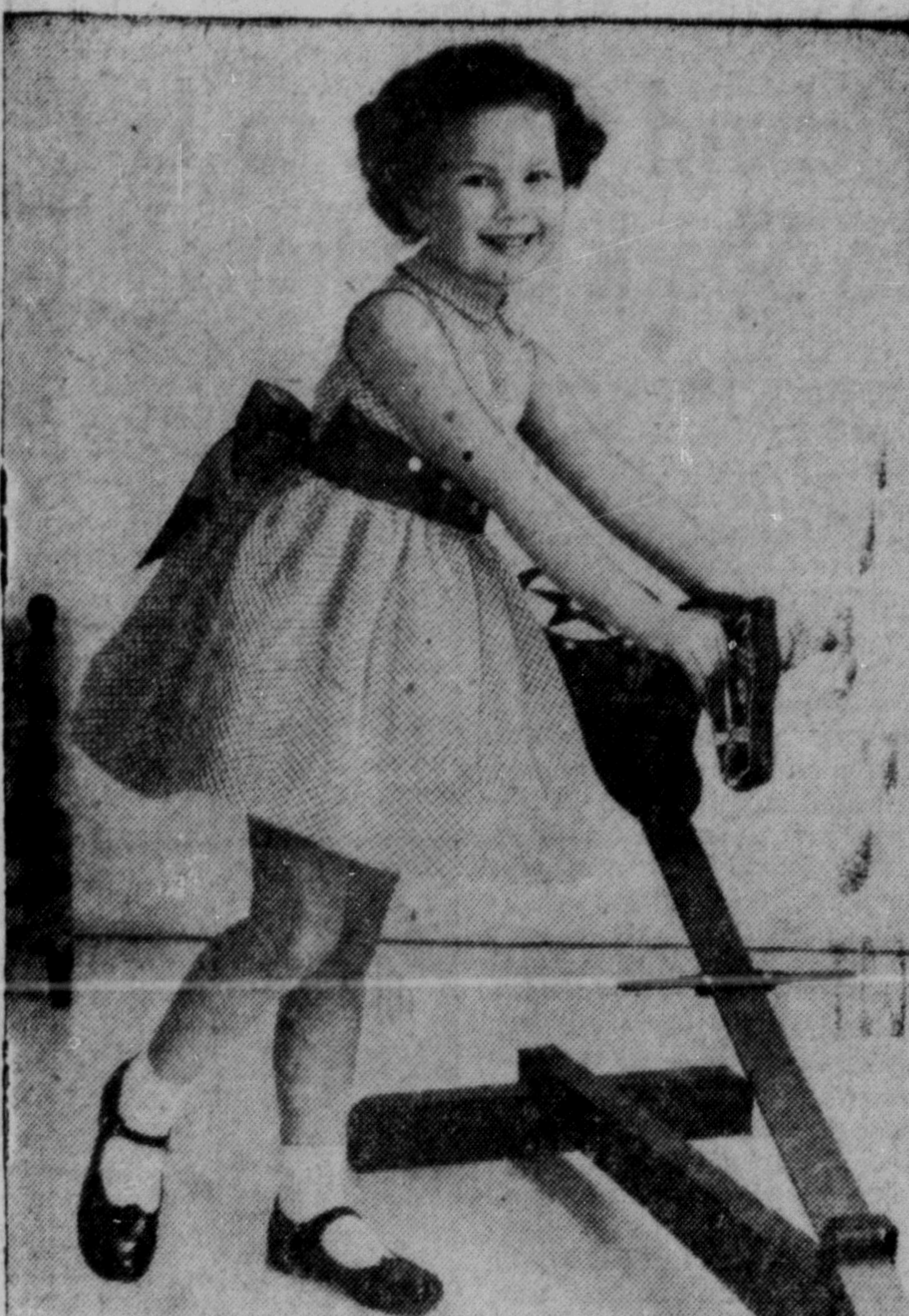
THIS YOUNG MISS can play to her heart's content in her pretty, sheer red and white dress. Trimmed with solid red at the collar, armholes, and attached, button-topped sash, the dress is made of nylon. It's easy to wash, dries quickly, and needs little or no ironing.